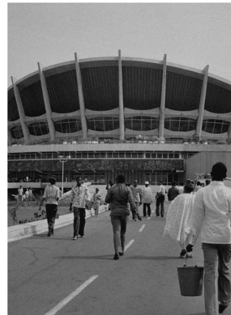
The national theatre in Lagos, Nigeria is a legacy of FESTAC 77'

Legendary band Les Wanyika performed in the 2023 Arusha festival.