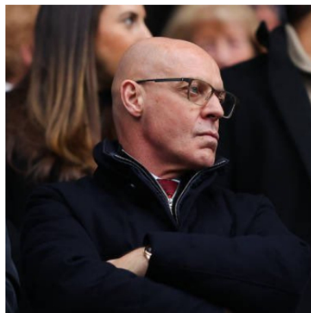
Sir. Dave Brailsford watches on as Manchester City fight back to beat Manchester United by 3 goals to 1 at the Etihad stadium