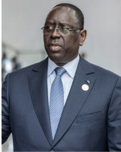
Incumbent Senegal President and 2024 Presidential Candidate H.E Macky Sall

Senegal is a hot potato and in news for all wrong reasons because of the impasse resulting from the elections. At the heart of this controversy is president Macky Sall who is thwarting efforts necessary for a regime change. Dire is the situation in Dakar that it has now forced the United Nations and other peace loving states to voice their concerns about the political instability resulting from this uncertainty. The country Senegal is named after River Senegal. The name of the river may derive from a Portuguese transliteration of the name zenaga. Portugal was the first European power to colonize Senegal through Dinis Diaz; au contraire their rule was short lived because of the French who took over.