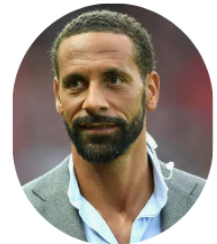
Rio Ferdinand ”

I don't think, there is a Manchester United supporter who has a brain who blames Erik ten Hag. The team needs adjustments. No quality there. Only a few are Manchester United quality. The rest must go. I hope the INEOS will sort that