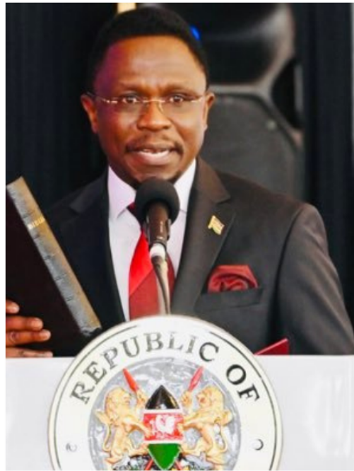
MOYASA C.S Ababu Namwamba during his swearing in ceremony

office, Ababu inherited a docket so faced by challenges, that he'd soon have to deal with calls for his sacking and ruthless opposition from all directions, including from some parliamentarians from the ruling party. However, it is the equanimity with which the former Budalangi MP navigated the storm, and got out of it strong that defined his character as a leader and as a person.