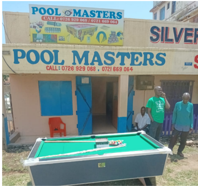
Pool Masters Kisumu Branch; Kondele

Since its founding, Pool Masters Amusement and Allied has rose through the ranks of business and outdone earlier behemoths of the pool tables and pool accessories business in Kenya.