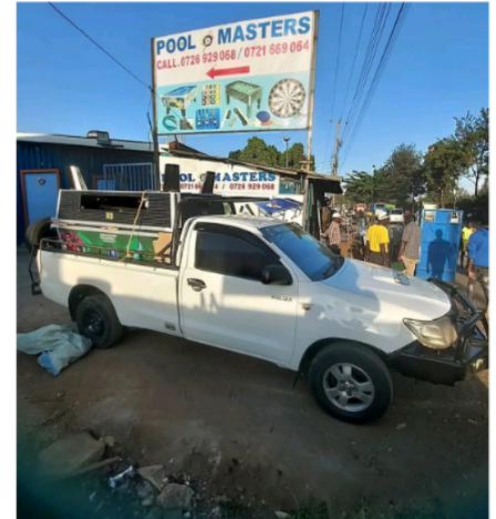
Poolmasters Headquarter in Nairobi

Highway next to Upper Hill Secondary School, in Embu along Meeu Highway Gakwegori stage, Eldoret along Iten Road Next to Palm Care Hospital Hawaii and Kisii along Kisumu Road, Next to Basongo Hospital near Rongo/Oyugis Junction.