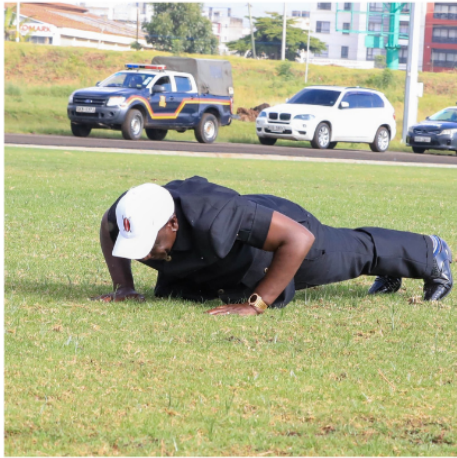
President William Ruto doing push-ups during the launch of Talanta Sport City Stadium