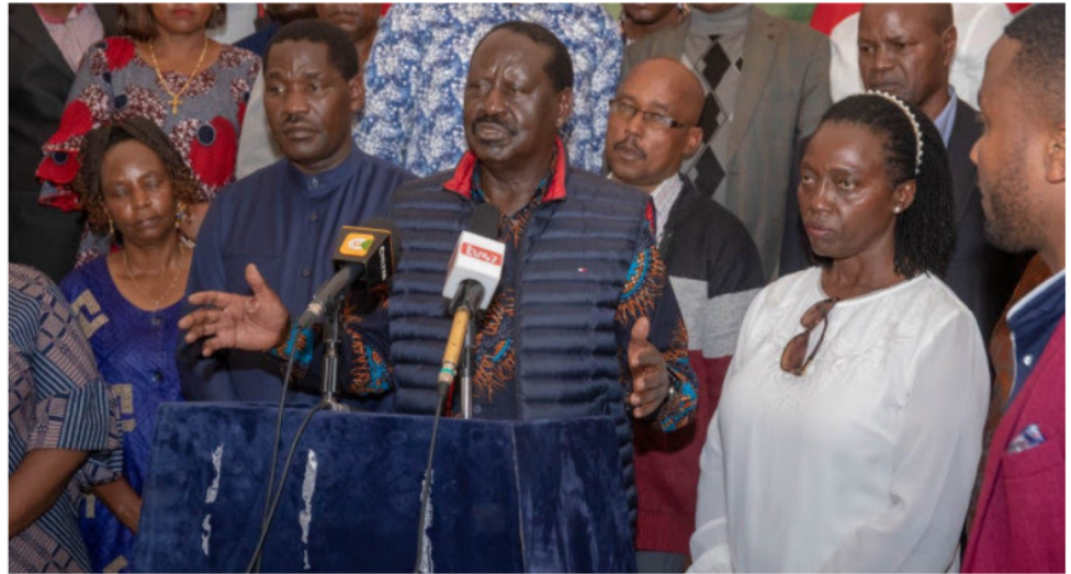
A. U. Commission Chairship Aspirant Raila Odinga with other Azimio leaders during a past press briefing

A tarradidle it might sound, this fact alone is important in the political life of Mr. Odinga as he was born with the genes of a politician, grown in politics and lived in politics. This means, there're just a few political bones he can't crack and balancing between the A.U commission job and internal politics is nothing he can't handle.