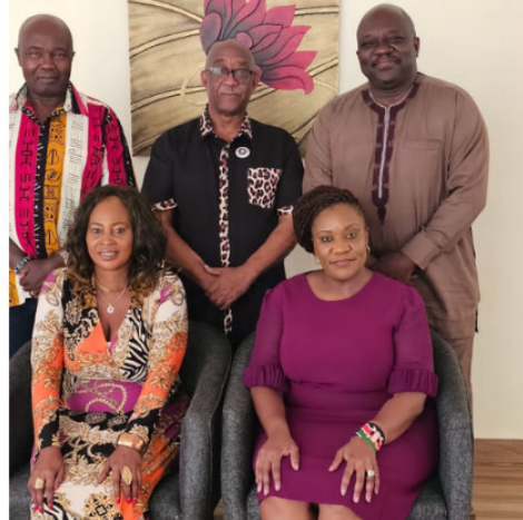
FESTAC AFRICA Secretariat pose for a photograph at Grand Royal Swiss Hotel