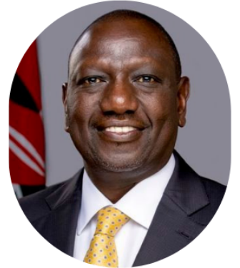
H.E WILLIAM RUTO ”

Let's all come together...and the National Assembly should pass a resolution for the freedom of Kashmiris and Palestinians.