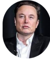
ELON MUSK ”