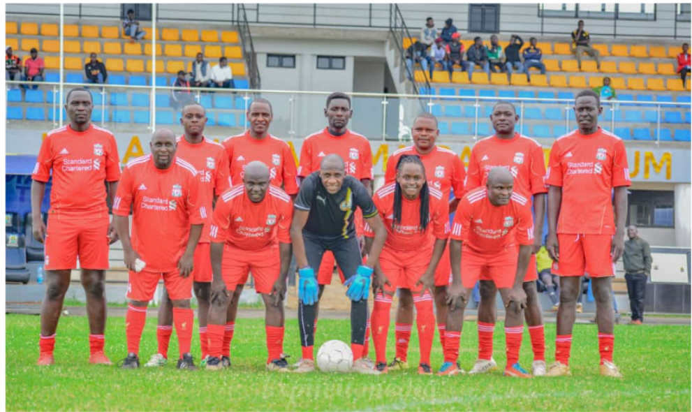
Former Harambee Stars players pose for a photograph during a pre-FESTAC legends match in Raila Odinga stadium, Homa Bay County on Wednesday 28th 2024.