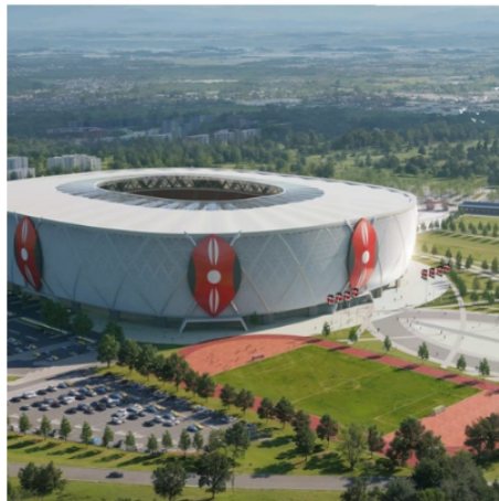
A concept of talanta Sports City Stadium