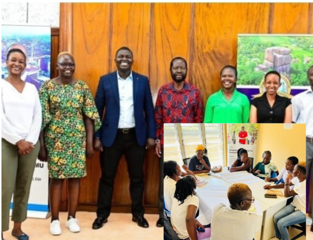
[Inset] Leaders from various women groups at the HOK HUB during a financial literacy session to build their capacity and enhance their economic opportunities.

In the days and months ahead, HOK remains committed to nurturing the growth and success of the HOK HUB, working hand in hand with partners and stakeholders to realize its full potential. Together, we embark on a journey towards a more sustainable, prosperous future - one where every voice is heard, and every dream is within reach.