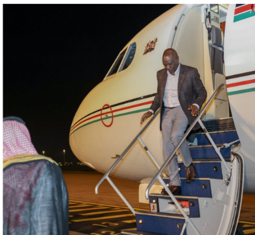
Kenya's President H.E William Samoei Ruto pictured boarding a plane

Then, in 1978, post the 'armageddon' that was the death of the founding president, the Late Daniel Toroitich Arap Moi not only inherited the instrument of power, but also introduced his own new ways of doing things, with respect to the country's foreign policy.