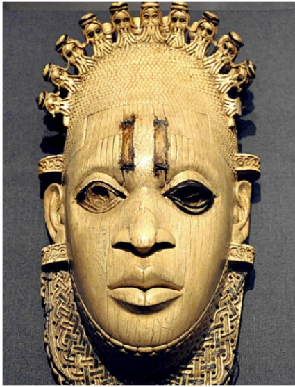
The official emblem of FESTAC 77' was a replica of the royal ivory mask of Benin. It was crafted by Erhabor Emokpae