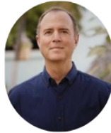
ADAM SCHIFF ”

Never waste valuable time, or mental peace of mind, on the affairs of others—that is too high a price to pay.