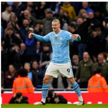
Erling Halaand celebrates after scoring a goal against Manchester United