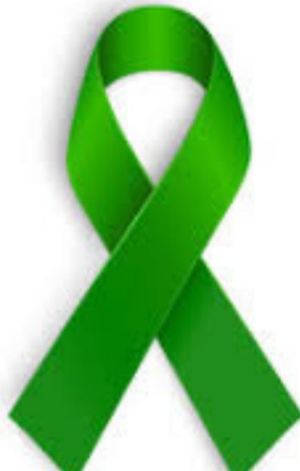
Universal symbol of Mental Health