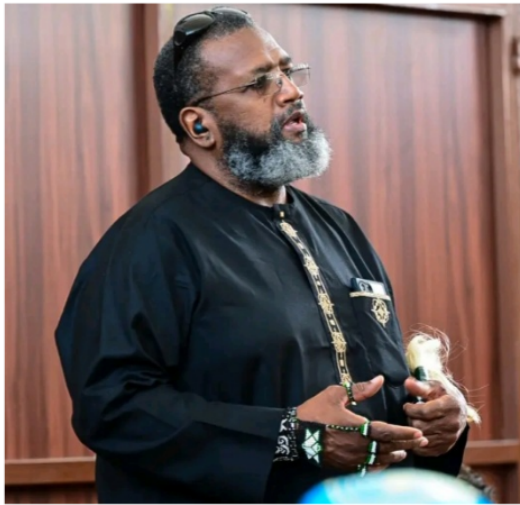
SOAD Minister of Minerals and Mines Keith Brown speaking during a meeting with H.E. Gov. Anyang' Nyong'o of Kisumu

The State of African Diaspora plays a significant role in the FeSTAC (Festival of Arts and Culture) by showcasing the rich cultural heritage, traditions, and contributions of Africans living outside the continent.