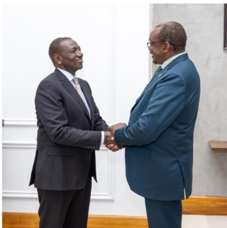
President Ruto meets Vice-President of Zimbabwe Kembo Mohad at Statehouse Nairobi