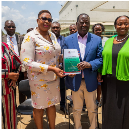
Aisha Jumwa meets Raila Odinga to brief him on the progress of 2/3 gender principle agenda