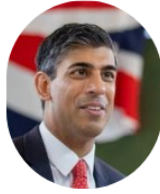
RT. HON. RISHI SUNAK ”

Through FESTAC Africa Festival, we are giving young people the chance to explore both their talents and potential. We encourage more youths to actively participate in this festival.