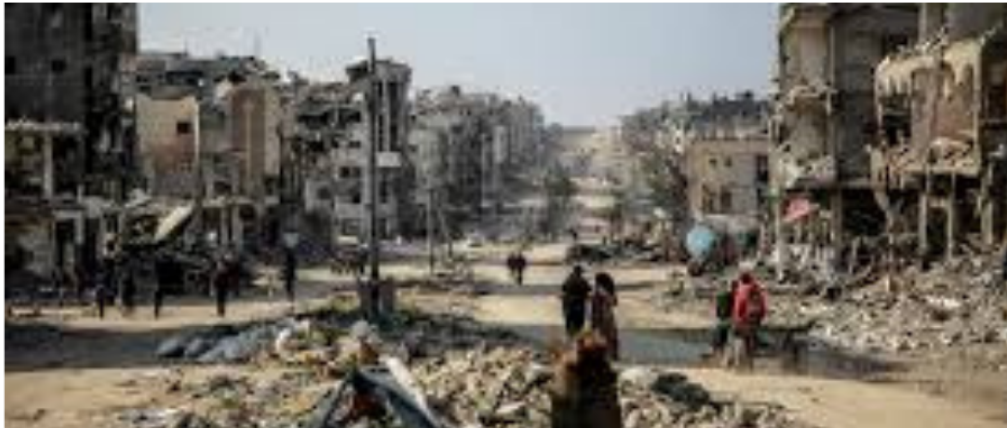
An image of deserted streets and destroyed houses in Gaza

With South Africa taking Israel to the International Court of Justice and the mass mobilization by Palestine against Israel's injustices in Gaza. Israel seems to be losing the massive support it had garnered at the start of the war. Israel seems to be losing both on the ground and in her storytelling as she faces pressure from the international community. It could be said that Israel has played into the hands of the Hamas. In this article, I will be looking at Hamas's strategy in the war.