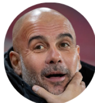
PEP GUARDIOLA ”