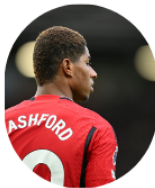
MARCUS RASHFORD ”

Hosted the Director-General of the World Health Organisation @DrTedros at @StateHouseKenya, Nairobi.