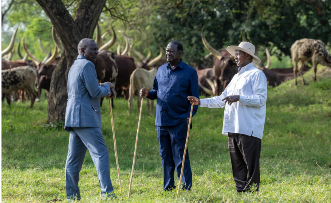
From left, Kenya's President William Ruto, Kenya's Opposition Chief Raila Odinga and Ugandan President Yoweri Museveni pictured at a meeting in the latter's farm

On Monday, a high profile meeting took place between East African giants H.E William Samoei Ruto of Kenya, H.E Yoweri Kaguta Museveni of Uganda and Fmr. Prime Minister of Kenya Raila Amollo Odinga. In the wake of viral pictures taken during the meeting, debates ensued online on the actual state of affairs between Kenya's sitting President and her opposition chief. Is there more to it than what meets the eye? Has a handshake been worked out behind the curtains? Why is the President so passionate about Mr. Odinga's ambitions to become the next African Union Commission Chairperson?. These are just but a few questions, aroused by this meeting, with conspiracy theorists already laying bare their ideas on what they think could be going on.