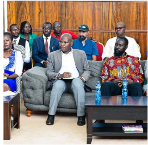
FESTAC Ambassadors watch on during a meeting with Governor Anyang' Nyong'o at City Hall on 26th Feb. 2024