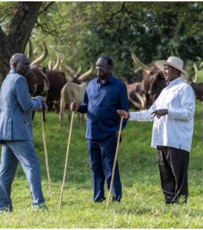
President Ruto, Raila Odinga and President Museveni meet in Uganda