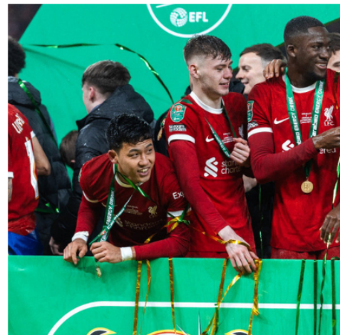
Liverpool's Team Celebrate after winning the Carabak Cup trophy