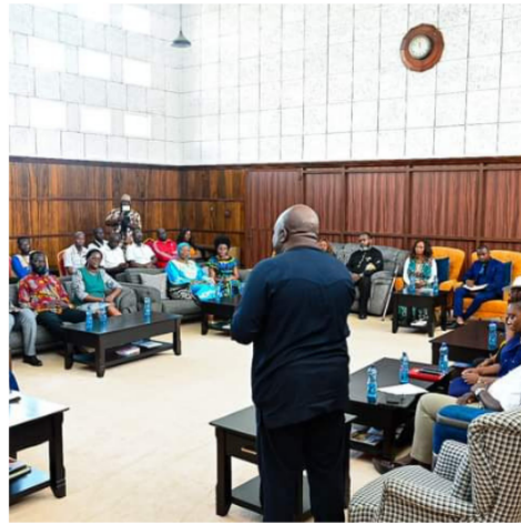
FESTAC AFRICA Festival Chairman Eng. Yinka Abioye addresses FESTAC Ambassadors during a meeting with Governor Anyang' Nyong'o in Kisumu