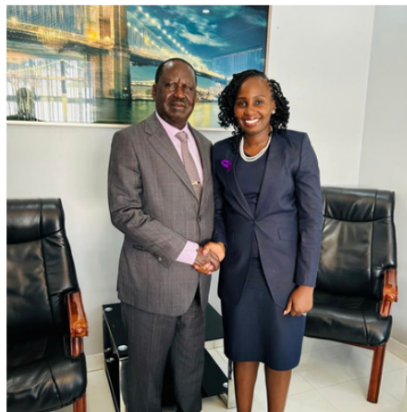
New LSK President Faith Odhiambo with Raila Odinga