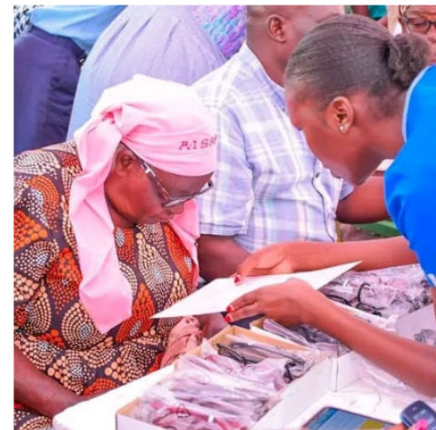
A beneficiary is attended to during Bob CEO medical camp in Kibuye market