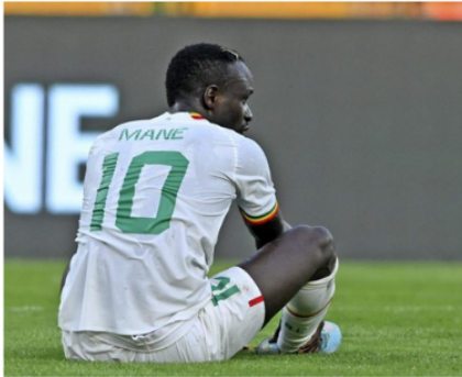
Senegal attacker Sadio Mané

Football's 'scriptwriters' did not get a thing wrong this week, as fanatics were put on the edge of the table with crazy turn of events, not only in the ongoing African Cup of Nations Tournament but also in the premier league and la liga.