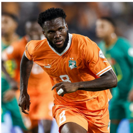
Franck Kessie celebrates after scoring a late penalty vs Senegal to send the game to extra time in the AFCON Round of 16 .