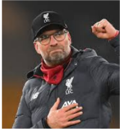
JÜRGEN KLOPP ”

I will leave the club at the end of the season. I can understand that that’s a shock for a lot of people in this moment, when you hear it for the first time, but obviously I can explain it – or at least try to explain it. I love absolutely everything about this club, I love everything about the city, I love everything about our supporters, I love the team, I love the staff. I love everything. But that I still take this decision shows you that I am convinced it is the one I have to take.