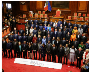
African leaders during the Italy-Africa summit

For instance, the cost of living has gone almost twice as high as it was in the former administration regardless of lowering it being a pedestal campaign chip in 2022. Increased taxes continue to threaten the sustainability of