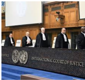
Judges of the ICJ in the court during a past hearing

Leaders from all over the world have across the week reacted to the watershed interim ruling by the UN's apex court ICJ on the South Africa genocide case against Israel. In the ruling, the International Court of Justice ordered the state of Israel to take measures to avert a potential genocide, citing the existence of plausible grounds to investigate state on the same.