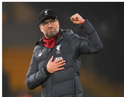
Liverpool's Jürgen Klopp

was Morocco. For a team widely expected to reach the advanced stages of the tournament- probably a semi-final- or even win it, the Atlas Lions were upset by South Africa's Bafana Bafana, who earlier on took the flak after a lacklustre start to the tournament and ended their group E campaign with only four points at the second position. Egypt, another football heavyweight was also knocked out by D.R Congo, a nation that in competition terms can be referred to as an underdog, with