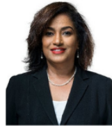
ESTHER PASSARIS ”

We must tackle the threats of a rising wage bill. Corruption is a threat to both levels of government let us work collectively to put in place control measures to monetize the use of public funds for procurement and expenditure to be within the law