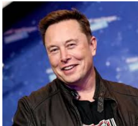
Elon Musk is World's Richest man

solely responsible for the growth or downfall of their businesses, depending on how much focus they give to both the external and internal factors influencing the business.