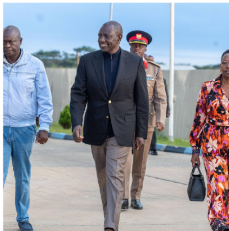
President Ruto is escorted to board a flight to Rome-Italy by D.P Rigathi Gachagua