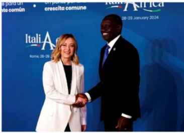
Italy's Prime Minister Giorgia Meloni meets with President of Kenya William Ruto inside the Madama Palace (Senate) as Italy hosts the Italy-Africa summit in Rome, Italy January 29, 2024.