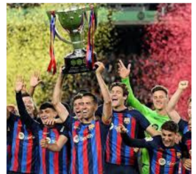
Barcelona lifted the La Liga Trophy for the 22/23 Campaign

Elsewhere, Barcelona fans were left cracking their knuckles after head coach Xavi Hernandez announced his decision to quit his position in the approaching summer holidays. This was after a disparaging defeat to 14th placed Villarreal in the Copa del Rey cup competition.