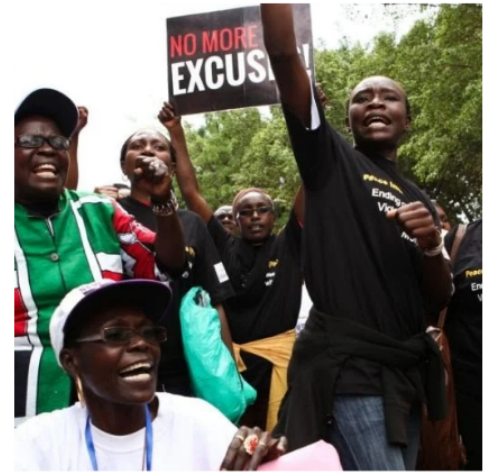
Kenyan women during an anti-femicide protest in Nairobi