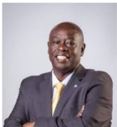
RIGATHI GACHAGUA ”

I will leave the club at the end of the season. I can understand that that’s a shock for a lot of people in this moment, when you hear it for the first time, but obviously I can explain it – or at least try to explain it. I love absolutely everything about this club, I love everything about the city, I love everything about our supporters, I love the team, I love the staff. I love everything. But that I still take this decision shows you that I am convinced it is the one I have to take.