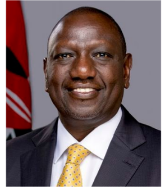
H.E WILLIAM RUTO

I want to announce that on June 30 I will no longer continue as the coach at Barça. I think the situation needs to change course, and as a culer, I cannot allow the current situation.