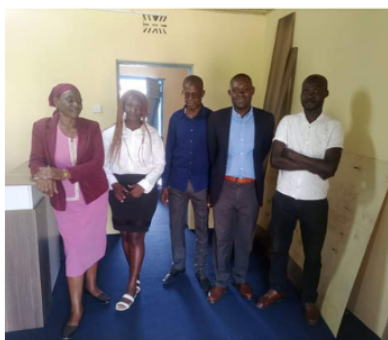
Liz Foundation staff during induction on December 27th