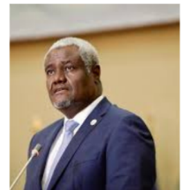
Moussa Faki Mahamat is the current chairperson for A.U Commission

You only need to look at the missing East African Heads of state at the Italy-Africa summit to tell there is an air of negativity towards the one state summons. What then in the first place is the role of African diplomats if from time to time presidents of their respective countries are to