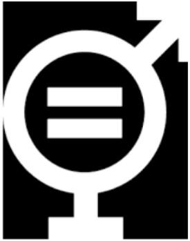
The UN Website; The universal symbol of Gender Equality

Let's face it: the world is a wonderfully diverse place. With different backgrounds, experiences, and perspectives, we bring unique ideas to the table. That's why diversity and inclusion are like the dynamic duo of success. By embracing diversity, we not only tap into a wellspring of innovation but also foster a sense of belonging for everyone involved. It's a win-win.