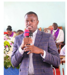
NDINDI NYORO

Arrived in Rome for the Italy-Africa Summit.