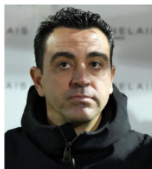
XAVI HERNANDEZ ”

THE IRREDUCIBLE MINIMUM for judicial reforms: CJ KOOME must go (grossly incompetent in all conceivable parameters...no leadership skill...ZERO understanding of the law...ZERO..ZERO!) and URGENT reconstitution of the Supreme Court..at least 4 judges must retire in public interest