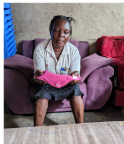
A lady carrying disposable sanitary towel

Despite every month, 1.8 billion people across the world menstruating, the topic was only put on the World Health Organization's agenda in 2022