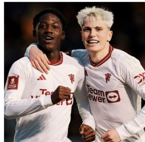
Man United's Kobbie Mainoo celebrates his first senior goal with teammate Alejandro Garnacho