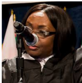
Judge Julia Sebutinde went out on a limb by dissenting on all the six orders given to Israel by the ICJ

Former U.K leader of opposition Jeremy Corbyn wrote a statement in support of the ruling. Via the statement, the Islington North MP said; "Today's verdict from the ICJ is a vital step towards justice for the Palestinian people. South Africa's case was thorough and devastating, laying out what Palestinians have been telling us for months; that Israel's relentless