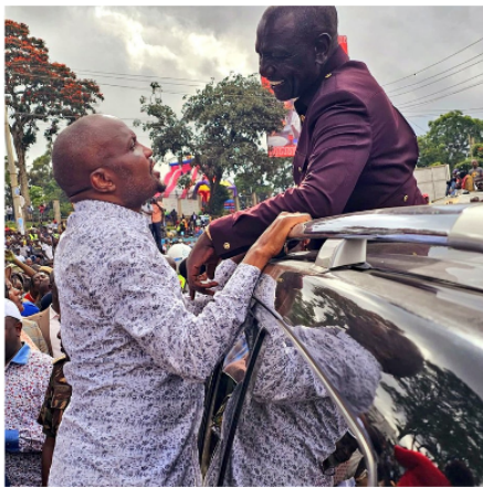
C.S Mosese Kuria hangs on President Ruto's vehicle during a public rally