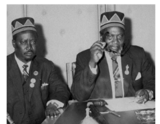
Kenya's First Vice President Jaramogi Oginga Odinga with founding President Jomo Kenyatta

For as long as history exists, Jaramogi's political career will continue to inspire many generations of leaders, not because he was perfect but in the view of his strong will in the pursuit of what to him was right for the country.