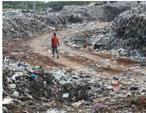
An image of Kachok Dumpsite in Kisumu before Rehabilitation

Waste pollution may not often feature prominently in discussions surrounding climate change, but its impact cannot be overlooked. The release of harmful greenhouse gases, such as methane, from decomposing waste significantly contributes to global warming and the alteration of our planet's climatic patterns. Additionally, the improper waste management practices observed in Kisumu exacerbate the release of these gases, making them a powerful driver of climate change.