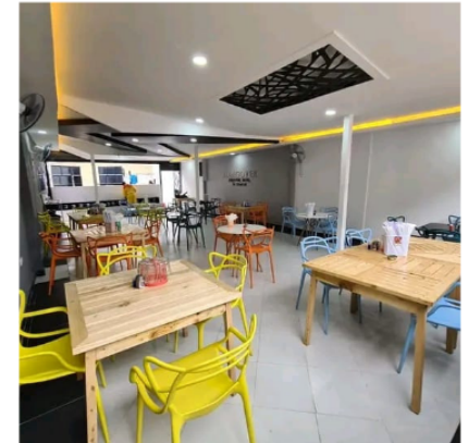
An interior of Hangover Kakwacha restaurant owned by Pauline Akwacha and Family

According to Kisumu CIDP (2022-2023), Kisumu county population is estimated at 1,155,574, with 556,942 males; 594,609 females and the youth making 40%. Shockingly 61% of them remain unemployed. This means that unemployment rate is more than 50% with a high dependency ratio at 87% according to ; (Labour Force Report, 2019). While the issue of unemployment is a national crisis, it remains critical to understand how elected leaders are tackling the issue either through a policy based approach or direct approach such as creation of business and employment opportunities. This means that a good number of people can be able to sustain their livelihoods without living in the fear of the unknown.