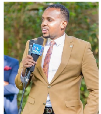
ALINUR MOHAMMED / PHOTO COURTESY

We have a government that says it will create jobs for Kenyans abroad but the acquisition of passports is a problem. Kenyans who applied for one paid Ksh. 4,500 or Ksh. 7,000 but are asked for a bribe; they are told there are no booklets, begging the question, how will they go?