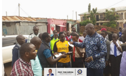
Kisumu Senator Prof. Tom Ojienda issues Bursaries to vulnerable students.

"He has been a revelation," a smiling supporter tells City Bite. "We are so blessed to have him as our senator. Unlike others, he has worked without limits nor borders. A senator's role per the constitution are oversight and legislation, but here we are, a senator that does more than just the two," He said.