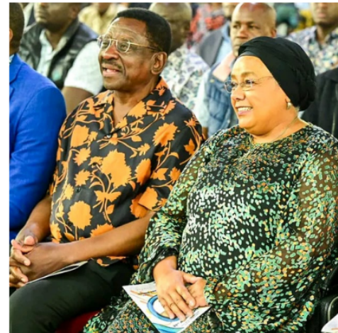
Gov. James Orengo & Margaret Kenyatta during Jaramogi's memorial at Ofafa Hall