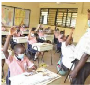
CBC Learners in Class

'No matter how strong you are, endless battles with will drag you down the path of misery,' a wily wise man once told his young son. As late as Wednesday, former education Cabinet Secretary George Magoha was still registered as a respondent in one of the many court battles against the novel competency based curriculum, which has faced seriate proxy-ish court battles since it was first adopted.