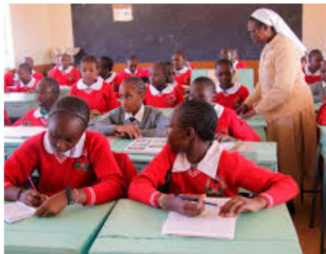
An instructor monitoring the learning of CBC learners

Perturbingly, these kids are already in schools, where learning is either expected to begin or has already begun. How are teachers to handle this? Especially with the limited resources catered for by the government?