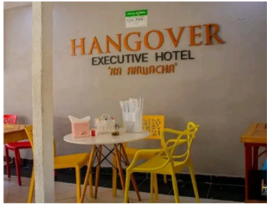
An interior of Hangover Kakwacha