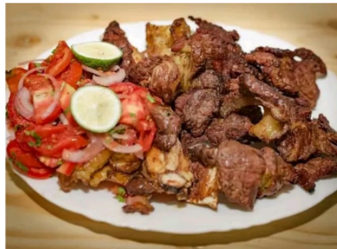
A dish is served at Hangover Kakwacha Restaurant owned by Pauline Akwacha & Family

It houses traditional delicacies and dishes such as black night commonly known as "Osuga", the spiderweb locally called "Dek/Akeyo", French Omallette, Fried Cabrito (Spanish name for Goat meat and Caporetto in Italian).