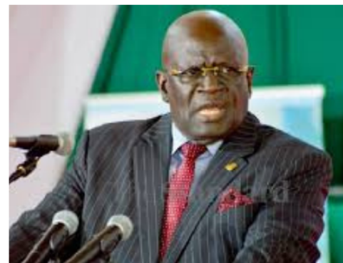
The Late George Magoha's name was removed from the respondents' register in a court case challenging the CBC

Another headache is about the number of teachers located per school with majority of them under contracts while there are so much cover. For example in a particular school only two teachers are available and are forced to take more than 5 subjects including those that they never specialized in. Nonetheless there are issues of more spacing to accommodate the growing number of JSS students, with some schools forced to learn under trees as some are asked to pay up to 5,000ksh to get new lockers.