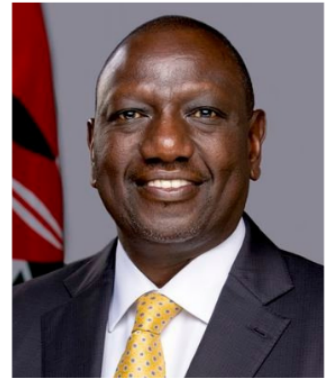
H.E WILLIAM RUTO

Trust me, Barcelona have very good future and I'm not talking about myself. I'm talking about the youngsters. That's why I'm playing them, I really want them to be ready for the future. It's not about me being the manager or not. These guys are special".