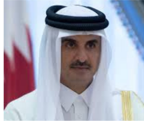
Tamim Bin Hamad Al-Thani is the current Emir of Qatar, Where Drinking alcohol in public is punishable by Law

A trailblazing move, the Saudi Arabian government is set to benefit in many ways from this new development, as it will open opportunities for more businesses and deeper Diplomatic bonds.