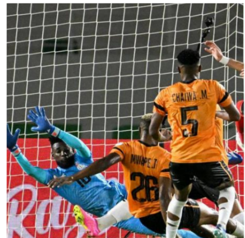
Hakim Ziyech scores past Zambian goalkeeper