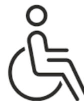
Universal Symbol of PLWDs

"Young as we are, we have already empowered around eight young women access basic needs for basic education. In the long-term, we want to extend our scope across East Africa and our purview to champion inclusion in the world."