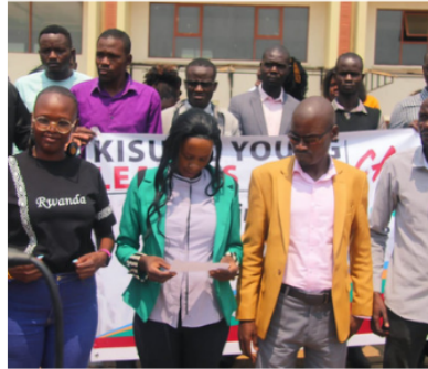
Young leaders during the launch of the Caucus

We are determined to champion issues to do with youth leadership, climate change, mental health, youth development, Gender based violence among others." She concludes.