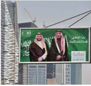
Portraits of Saudi King Salman (R) and his son Crown Prince Mohammed bin Salman (MBS) in Riyadh

For the first time in over seven decades, there will be a liquor store in Saudi Arabia, City Bite has learnt. In a mouth wagging report that was first published by Reuters, the store will sell alcohol to non-muslim diplomats from across the world.