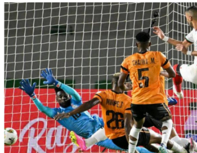
Hakim Ziyech scored the only goal as Morocco eased past Ghana to seal their top spot in Group C

For Cameroon, it was an erratic end to a lacklustre campaign that saw them narrowly survive to the next round following a five-minute turnaround coming from a 1-2 losing position to a 3-2 victory at full-time, which secured them the second place position in their final game for group C.