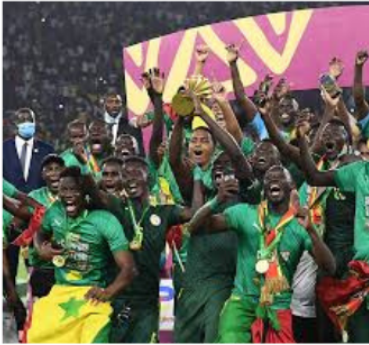
Senegal National Football Team Lifts the AFCON Trophy in 2021

After an entertaining opening week, the biennial AFCON tournament continued in a dramatic fashion after its group stages came to an end with the sacking of coaches and surprising exits, including African big dogs of football like The Black Stars.