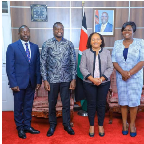
Gladys Wanga,Ndindi Nyoro,Anne Waiguru and Governor Sang pose for a photograph