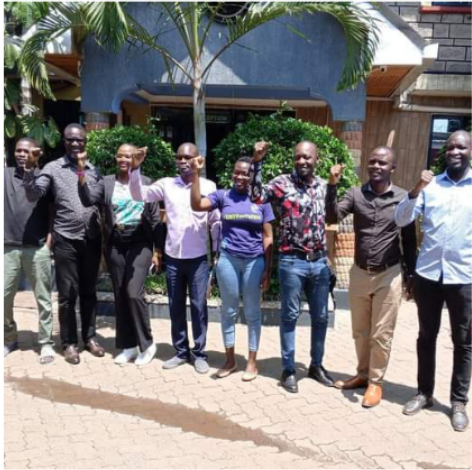
Kisumu Young Leaders Caucus Secretariat during a meeting on Thursday.