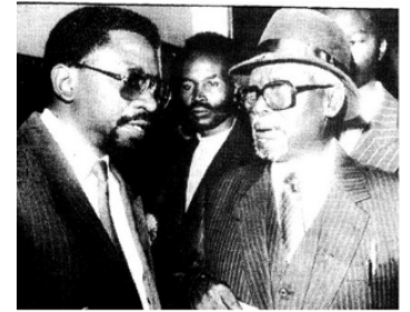
James Orengo and Jaramogi Oginga Odinga in a Taifa Leo Newspaper Cover

For instance, on Sunday, Siaya County Governor James Orengo wrote on X, "Yesterday we reflected on the life and times of a man who dedicated his life to the struggle for a better Kenya. Jaramogi Oginga Odinga was a giant on whose shoulders we stood; a true patriot and servant to this country."