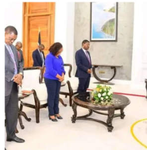
Attorney General Justin Muturi bows to pray at State House

fingers on the same judiciary , it raises several questions about the independence of the judiciary. This might appear as an attempt to improve the relationship between the executive and judicial branches of government, with an aim of having effective and unified legal system. A good case study is when Chief Justice David Maraga sought to engage in dialogue with President Uhuru Kenyatta following public disputes over judicial decisions.