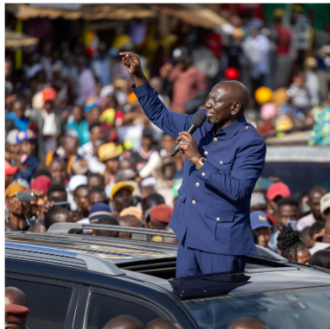
President Ruto addresses a rally.