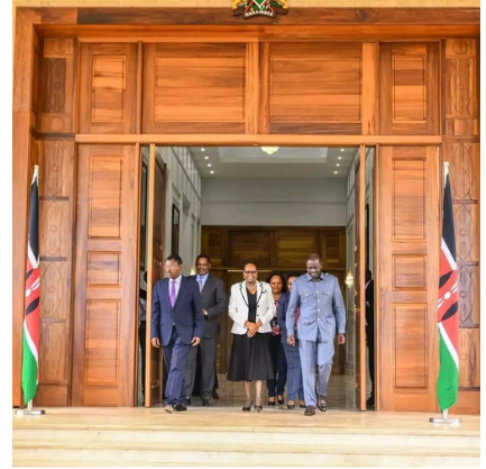
Pres. Ruto, C.J Martha Koome,A.G Justin Muturi and Speaker Moses Wetangula