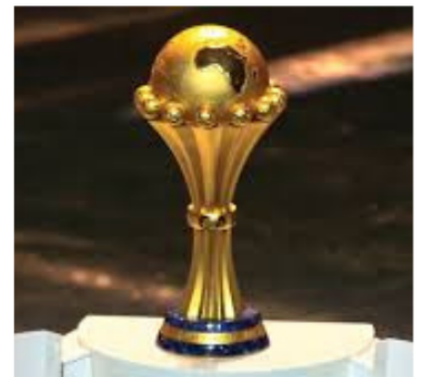
A photograph of the AFCON Trophy

In group A, Equatorial Guinea beat Nigeria to the top position by goal difference after both tied on seven points each while Angola rests at the helm of group D, where 2019 Champions Algeria were competing with them. Mali outdid both South Africa and Tunisia to the top of group E while in group D, Morocco was the undisputed winner.