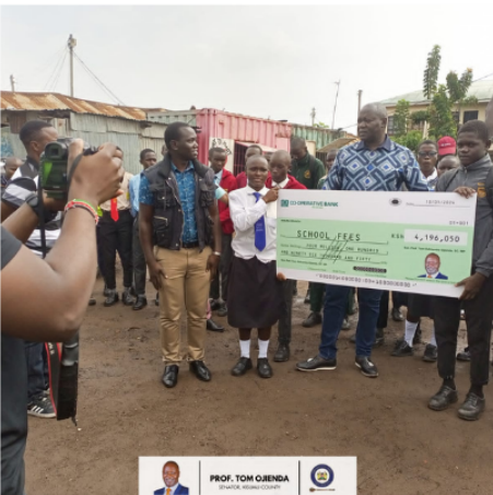
Senator Tom Ojienda with the beneficiaries of his scholarship program.