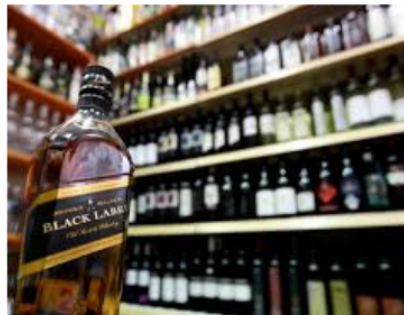
An image of a liquor store shelf

one of the many efforts by Crown Prince Mohammed Bin Salman to transform Saudi Arabia into a major business and tourism hub, which is a part of Saudi's vision 2030 initiative, with further sources branding it an effort to encounter the reports of improper exchange of special goods and alcoholic beverages received by the embassies of non-Muslim countries inside Saudi Arabia through new amendments that will allow and ensure that all diplomats of non-Muslim embassies have a special access to these special products and spirits within a specified quotas.