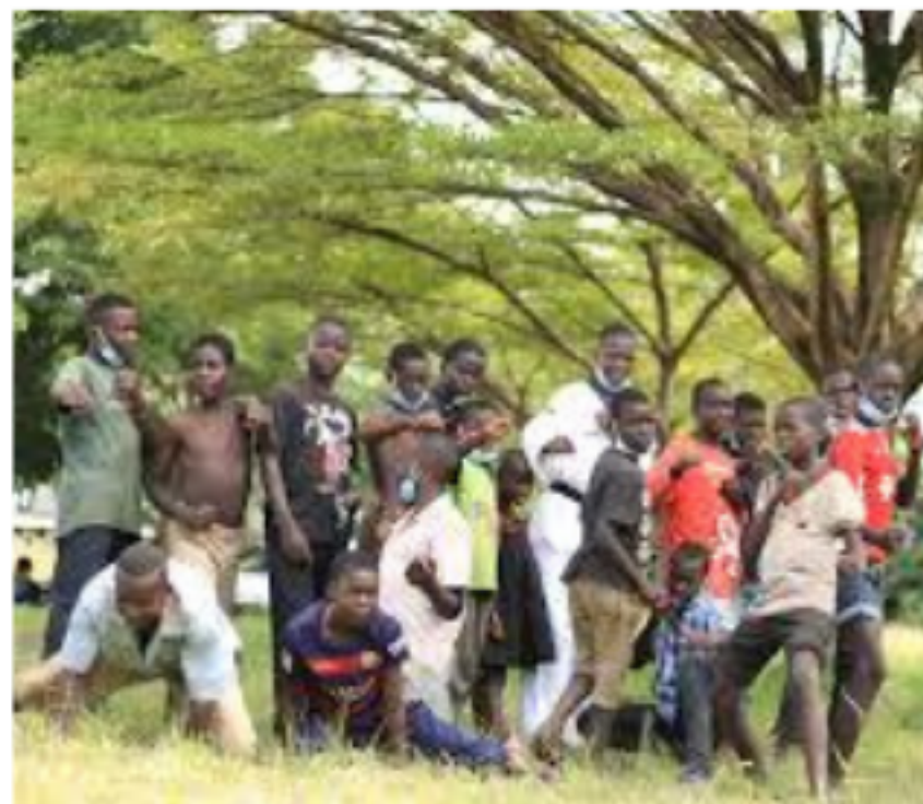
Beneficiaries of Homeless of Kisumu Organization