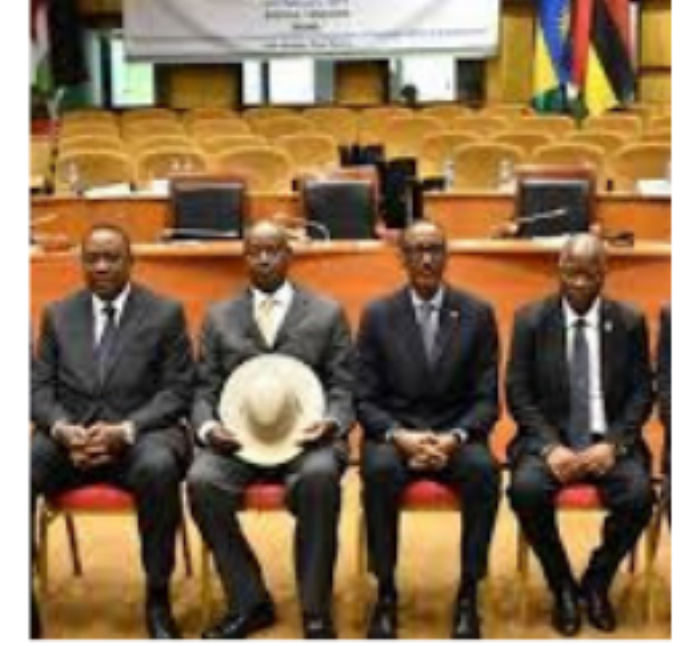
From left: Uhuru Kenyatta, Yoweri Museveni, Paul Kagame and John Magufguli (Deceased) during a past EAC Summit

Additionally, both countries agreed to support the peace building and peace keeping efforts in the conflict hit Eastern DRC where there is a never ending threat to humanity. The conflict in Somalia was also a key area that the two ministers vowed to work with relevant stakeholders to address and restore a lasting peace in the horn of Africa.