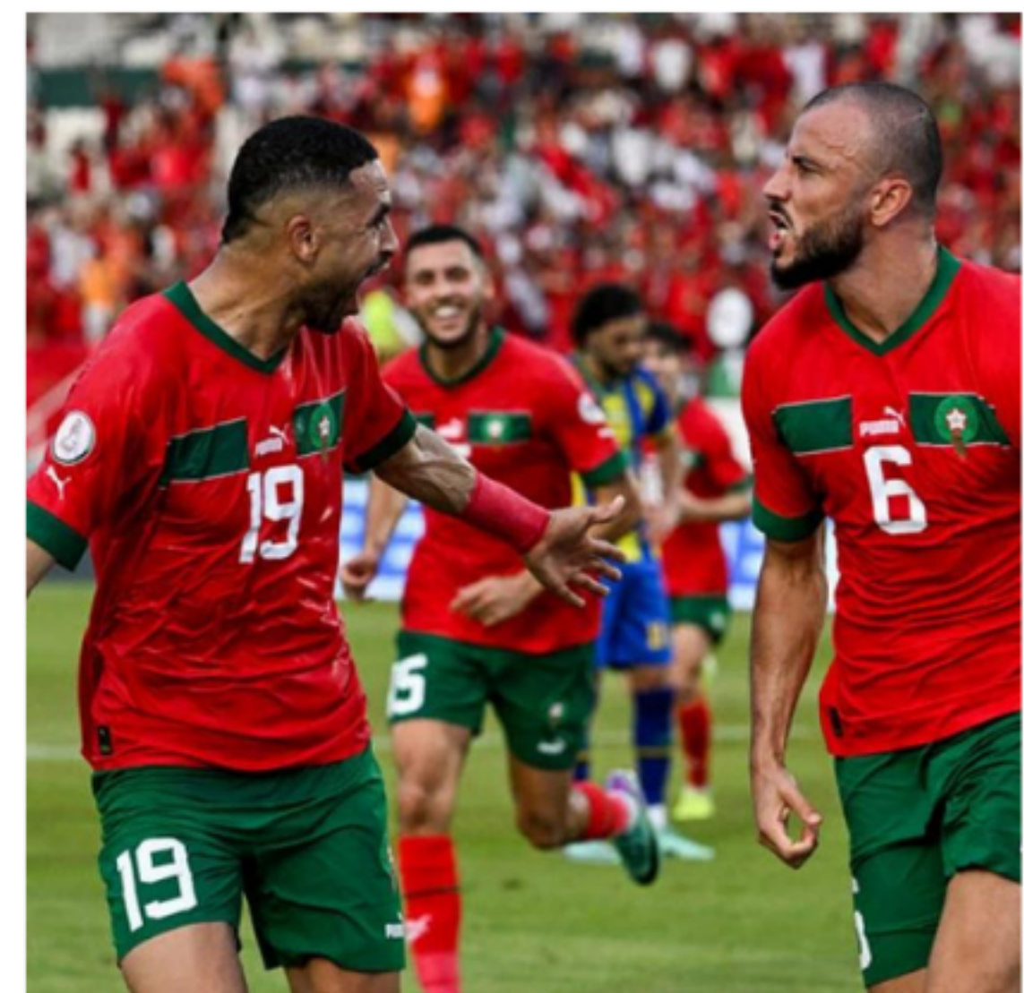
En-Neysri celebrates with teammates after scoring for Morocco