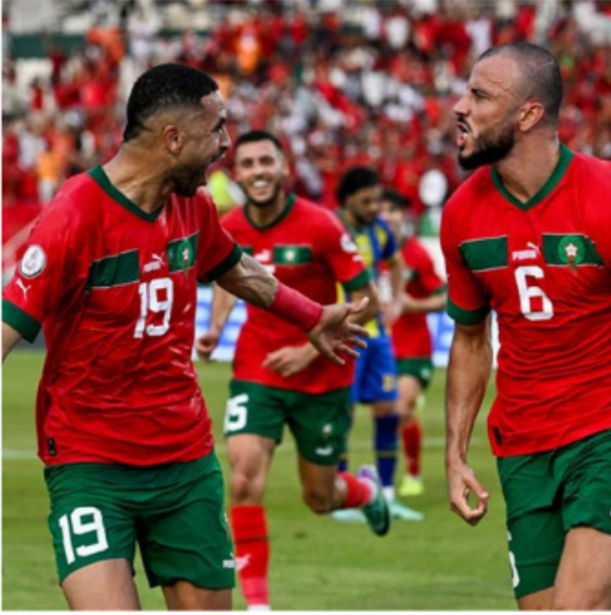
Morocco shines in their opening match in AFCON

Africa's most competitive football tournament AFCON began in a classic fashion on Saturday the 13th of January.