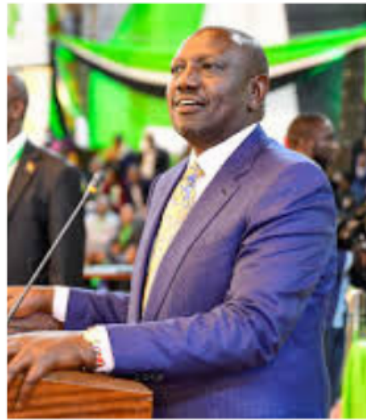
President William Ruto during the ANC NDC in 2022

Interestingly fast forward one year, a looming disagreement between the executive and the judiciary follows a familiar trend, only this one exacerbated by the fact that the same person who promised to save those in the corridors of justice is now promising to defy 'corrupt judges', without publicly providing what should define a corrupt judge. Without a doubt, the question that needs answering is whether our country will ever enjoy the stability of a good working relationship between all arms of government.