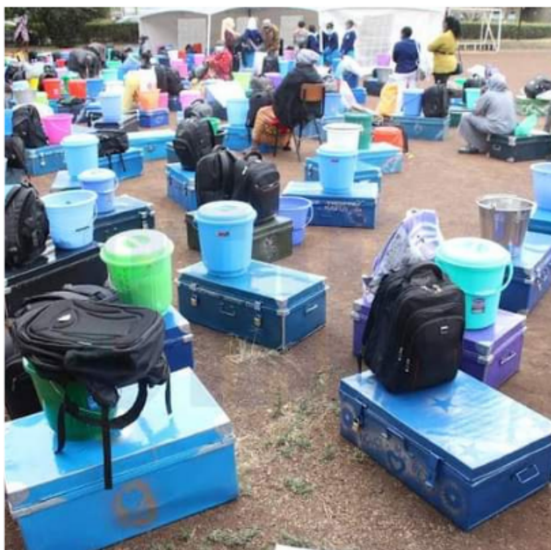
Form ones join schools