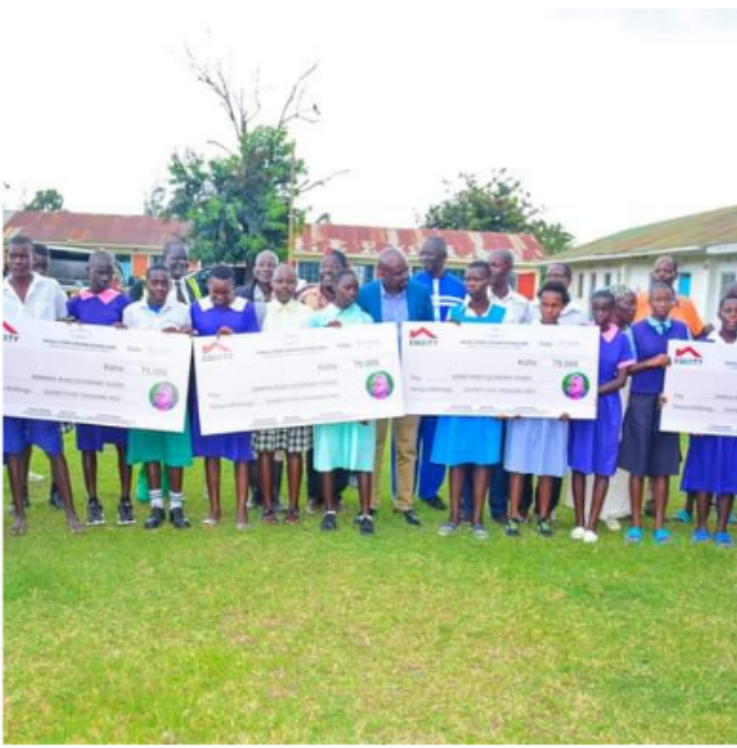
Beneficiaries of Fred Odumo's Scholarship program pose for a photograph.