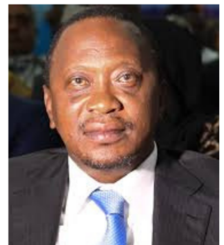
Former Kenyan President Uhuru Kenyatta.

If like the former administration, this one also finds the justice system untrustworthy, then where does the truth lie, given those in situ at the judiciary continue to persist on the credibility of their work?