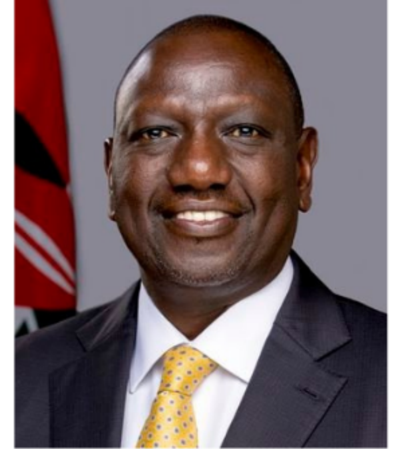
H.E WILLIAM RUTO

The Government is committed to creating a decent environment for small traders such as Mama Mboga in recognition of their contribution to the growth of our economy. We will inject Sh100 Million to help complete the Masinde Muliro Market.