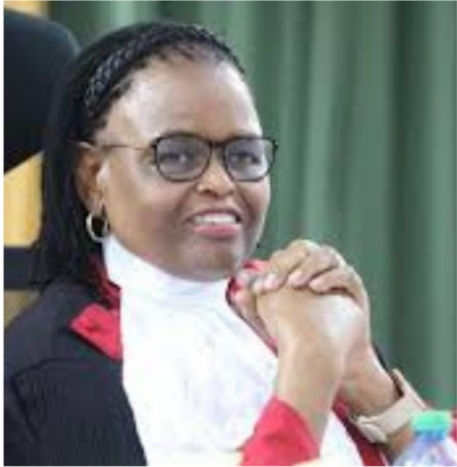
Kenya's Chief Justice Martha Koome watches on during a court proceeding

In the wake of 2017 presidential petition ruling that infamously nullified for the first time in Africa a presidential election, the then incumbent head of state publicly impugned the judges of the supreme court of Kenya, in a move that kickstarted a lacklustre relationship between the executive and the judiciary arms of the government. Mild in the beginning, this fissure grew by the year, as the Judiciary got underfunded, with its nadir reaching a point where, the then chief justice and the president engaged in passive aggressive tendencies of aiming sly digs at each other during joint public forums.