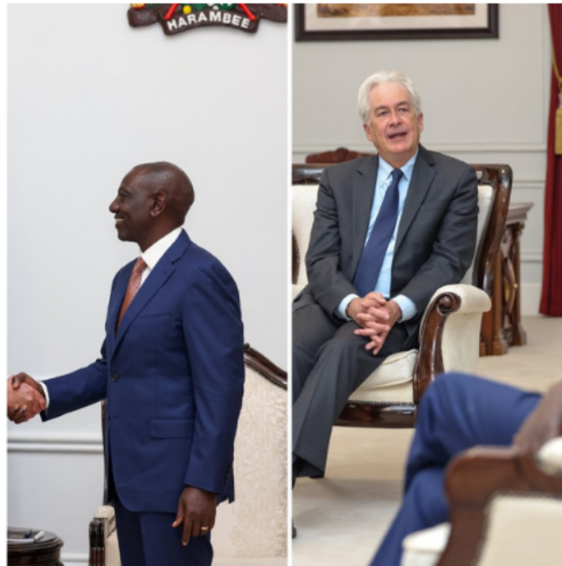
President Ruto meets CIA Director William Burns at State House Nairobi