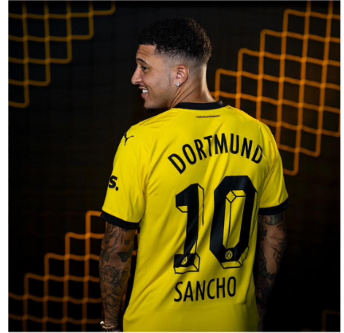
Jadon Sancho rejoins Borussia Dortmund