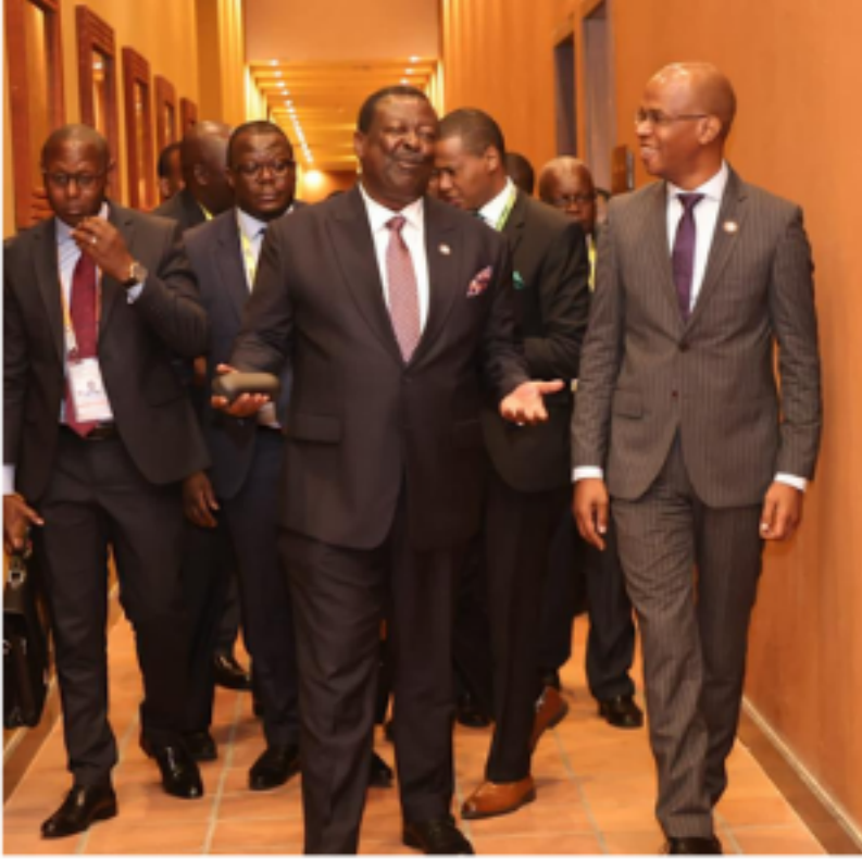
Kenya's PCS Musalia Mudavadi with Tanzania's January Makamba on the sidelines of NAM Summit

In the sidelines of the ongoing summit for non-aligned movement member states in Kampala, Kenya's Cabinet Secretary for Foreign and Diaspora Affairs H.E Musalia Mudavadi had a conversation with his Tanzanian counterpart Dr. January Makamba where the former called on East African Community's member States to rally together and embody the vision of the intergovernmental organization, which relates to a prosperous, secure, stable but most importantly a politically united East Africa.