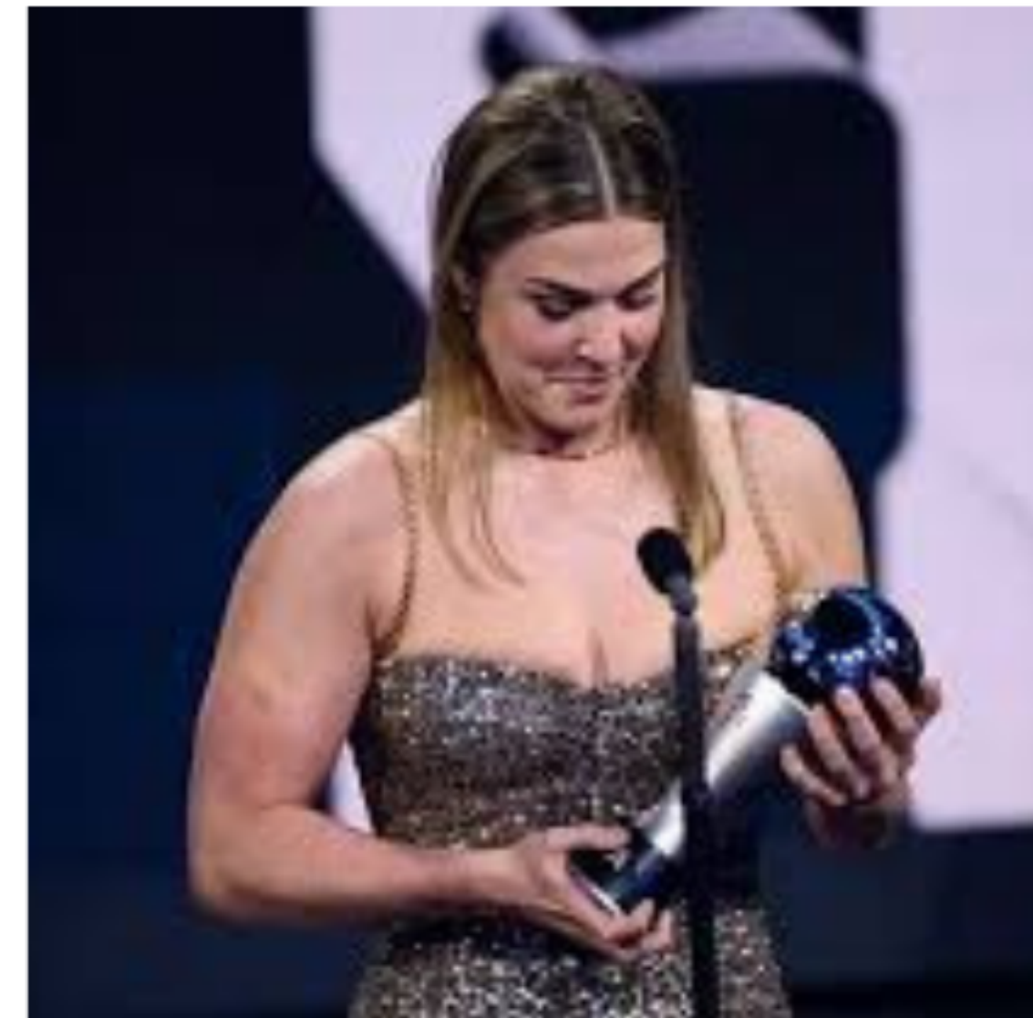
Mary Earps with her trailblazing FIFA The best Award