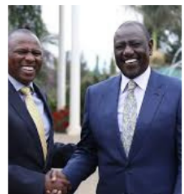
Kikuyu MP Kimani Ichung'wa (Left) with President Ruto (Right)

A flashback to 2018 and you could see a sour Kimani Ichung'wa and the ilk on the roofs of SUVs crying about Uhuru Kenyatta's deception and what not in public rallies. Why changed their respective standpoints? Why turn on their own? . We are not to judge, especially when politics is involved and truth be told, mixed signals are an ironclad trait of politics but why such a swift change of heart?