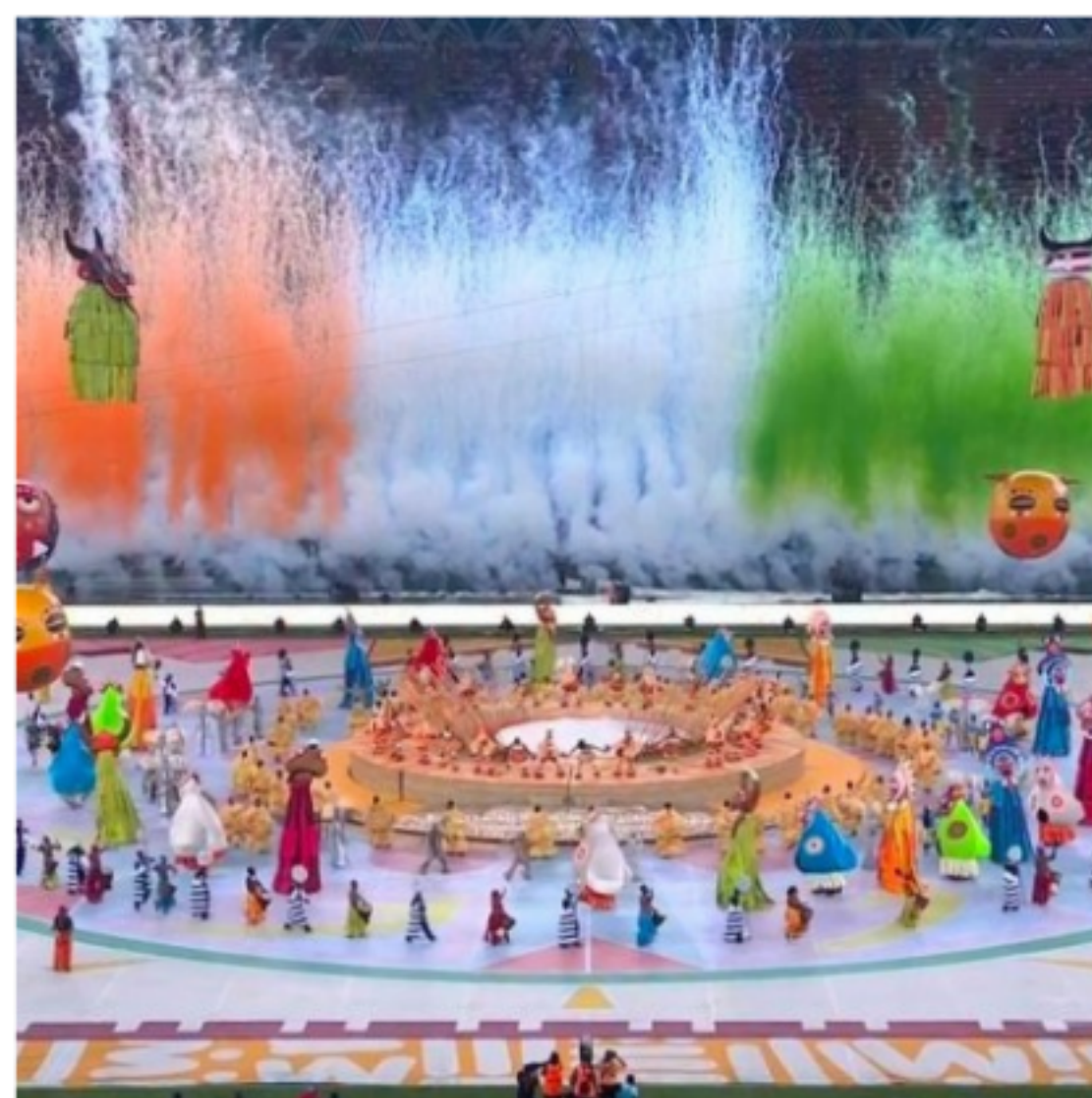
Aesthetic scenes in the AFCON Opening Ceremony.