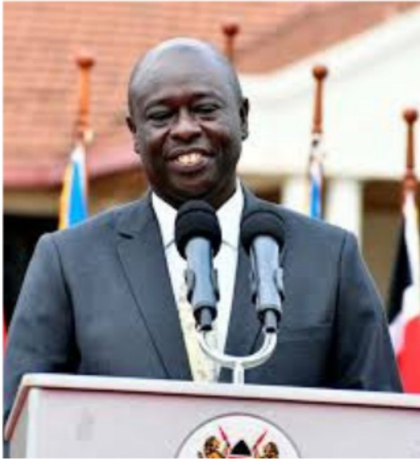
Kenya's sitting Deputy President Righathi Gachagua

From the time he was surprisingly picked by President Ruto as his would be runningmate in the run up to 2022 presidential poll, many political commentators casted their doubts on the feasibility of a potential ChaguaRuto administration, especially after it was earlier rumored and widely expected that Kithure Kindiki was William Ruto's preferred runningmate.