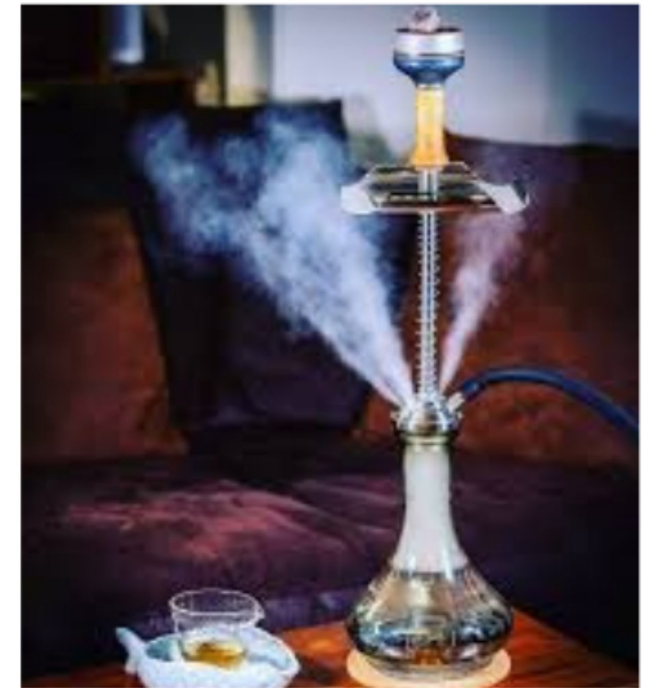
Shisha is a banned substance in Kenya.

Some politicians have paid so much attention to grabbing and maintaining power, that the rule of law is gradually becoming diminished. Nothing is right, nothing is wrong, just a bunch of charlatans with their stomachs to watch out for.