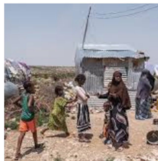
Drought & hunger struck Somaliand

Via his statement, Mudavadi goes ahead to urge member states to amicably and timely resolve emerging diplomatic altercations before they potentially mutate into crises, as the EAC has key aims that encompass widening and deepening socio-economic and cultural integration to improve the quality of life through competitiveness, foreign direct investments, trade and quality production.