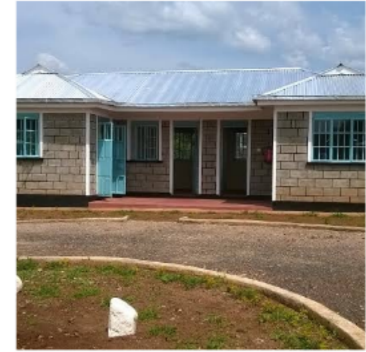
FORWAC Learning Centre Administration Block

whom are currently enjoying success in their respective fields of education-this particular writer included-.