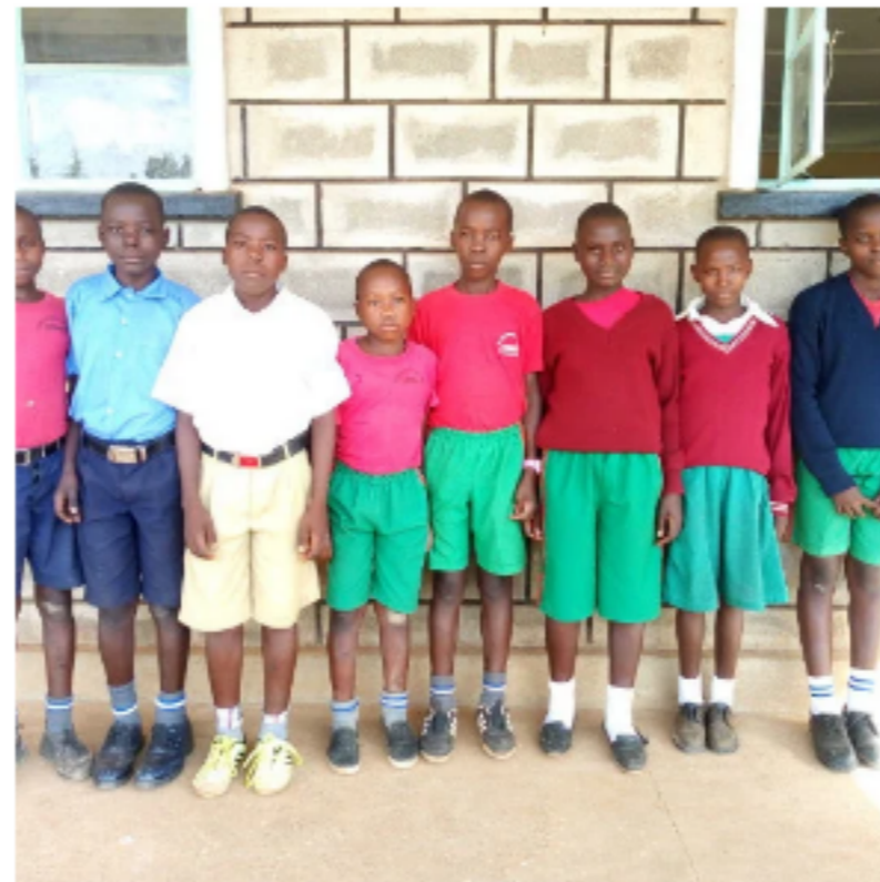
Pupils from FORWAC learning centre pose for a photograph.

Okello boasts a sterling reputation in community service and the public benefit sector, having not only sponsored a significant number of children to schools but also supported community development projects within the borders of Gem Constituency and beyond.