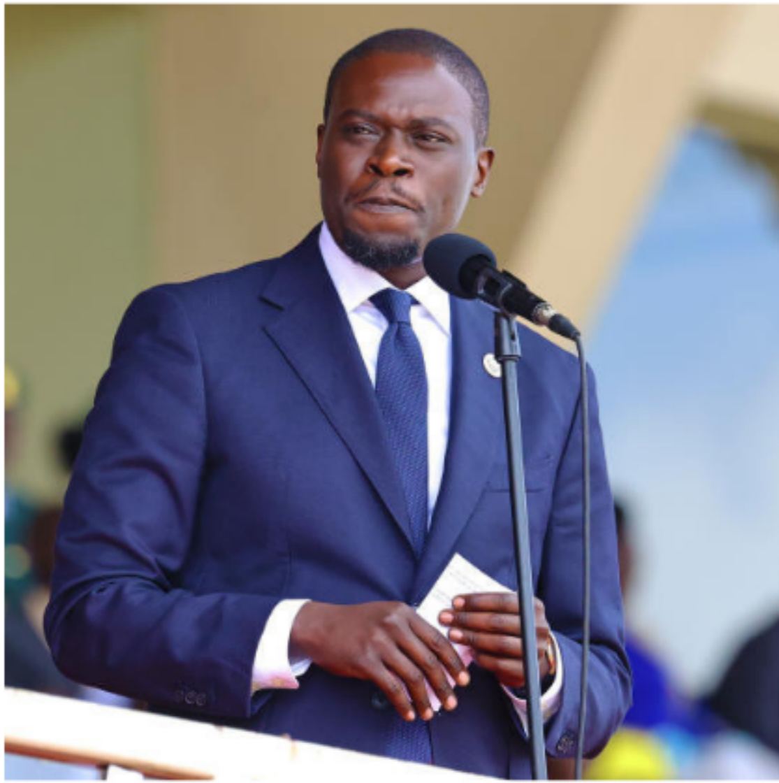
Nairobi County Governor H.E Johnson A. Sakaja

County with what its designers have described as nutritious meals at a subsidised cost of simply kshs 5.