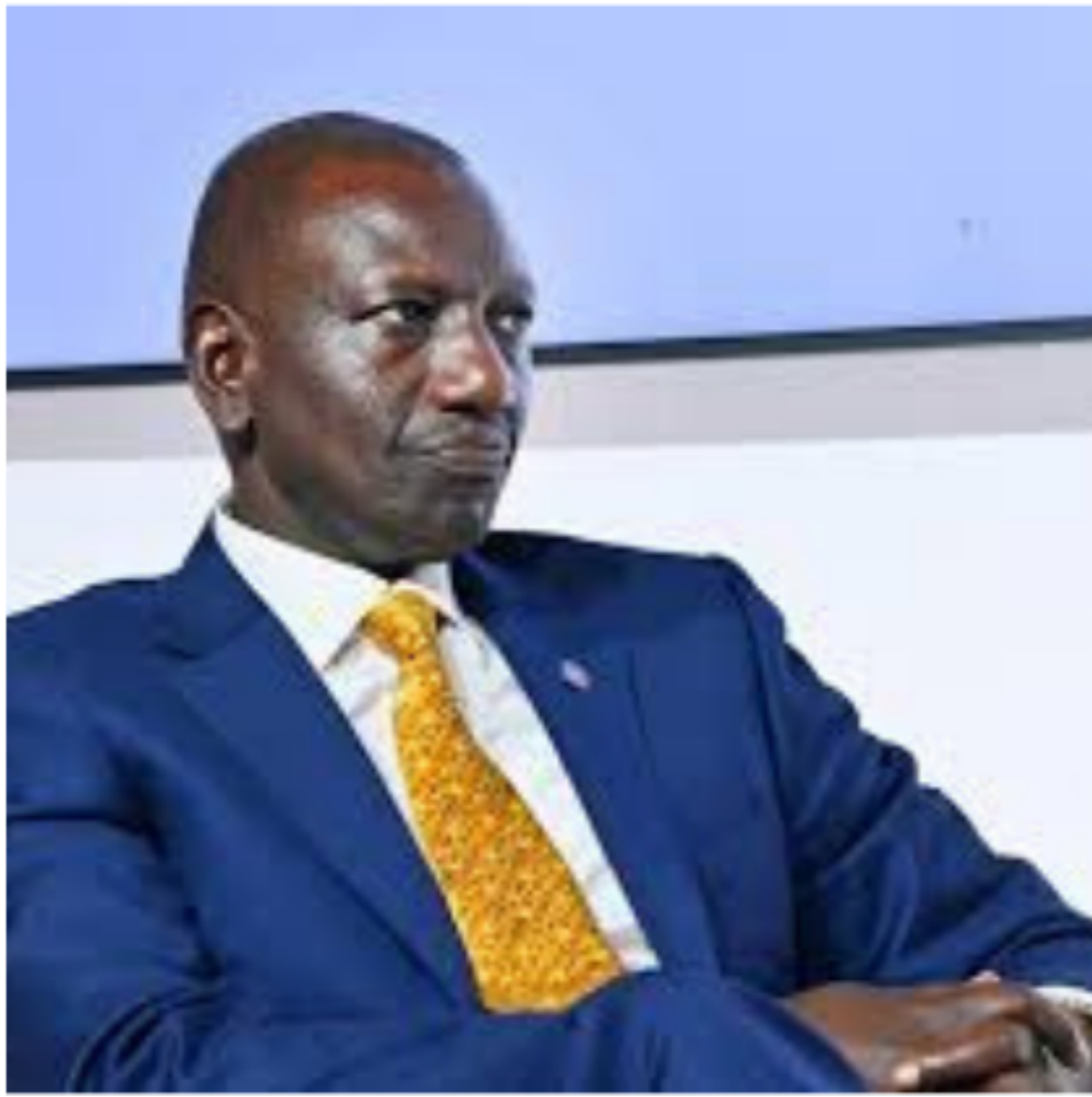
Kenya's President H.E William Ruto

Through a special Kenya gazette issue Vol.CXXVI-NO.3, President William Ruto on Monday the 8th of January revoked the appointments of some four members of the board of directors at Kenya Railways Corporation, who incredibly enough were all appointed by former head of state H.E Uhuru Kenyatta.