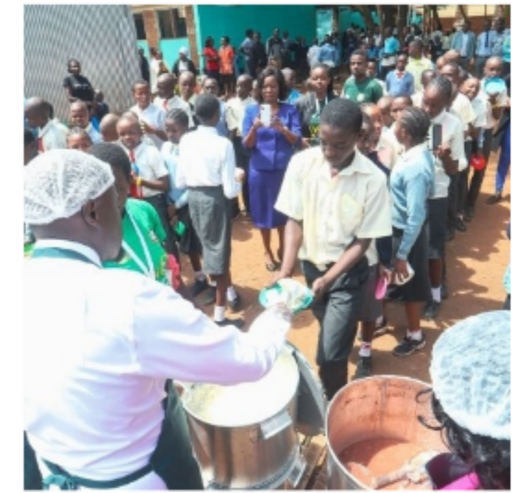
Pupils from diverse schools across Nairobi line up for a meal, served by Sakaja

While talking to our reporters, one parent said; "We are so grateful to God for taking us this far. It is