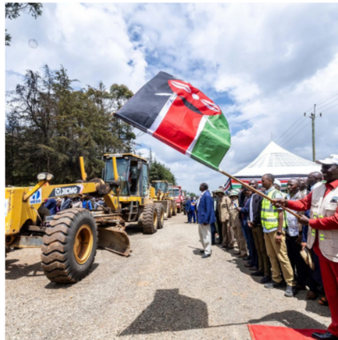
President William Ruto Launches the tarmacking of Boiman-Kwa Mumbi Road in Ol -Jorok Narok County