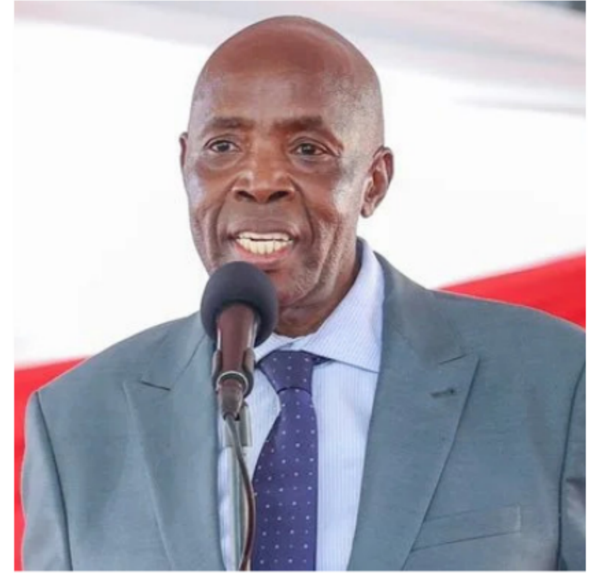
Education C.S Ezekiel Machogu releases 2023 KCSE results.