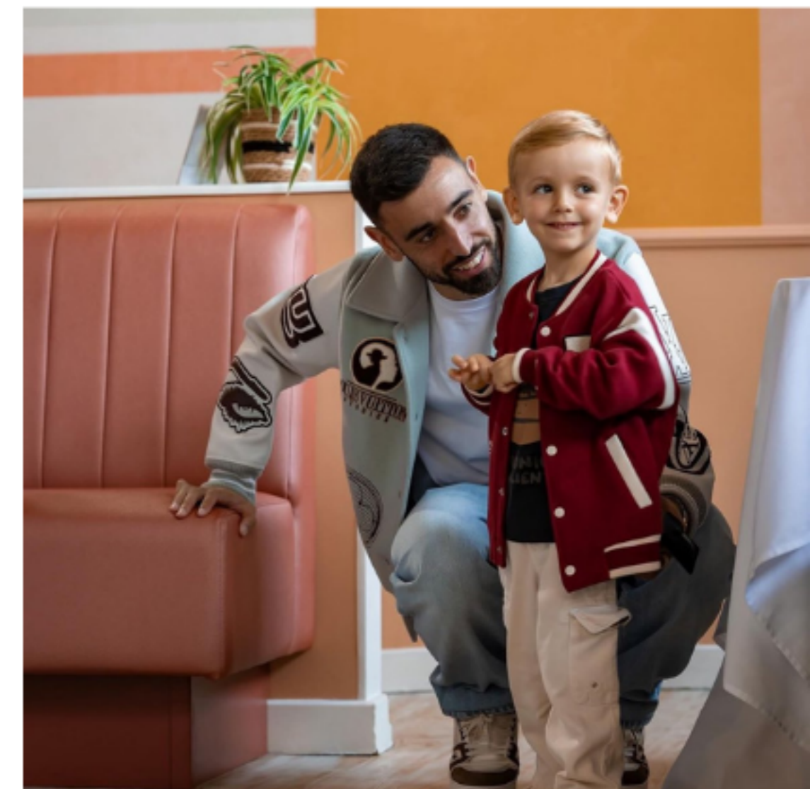
Manchester United Captain Bruno Fernandes with his son.