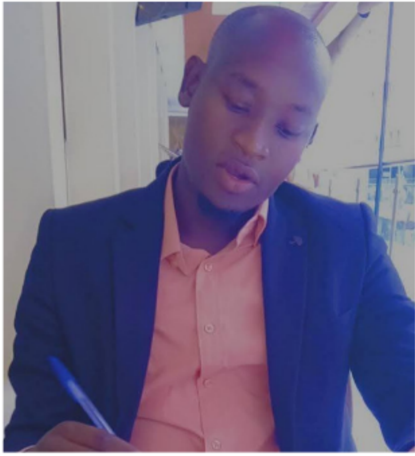
By Ochieng' Abong'o

In the pursuit of achieving an optimal state of gender parity, it becomes imperative to retire the prevailing cancel culture methodology concerning the vulnerabilities of young boys and men. Analogous to their female counterparts, male individuals innately embody the entirety of the nine quotients of life, encompassing crucial emotional intelligence. This facet, perceived as a pronounced disparity between genders through the lens of natural selection, underscores the need for a recalibration of societal expectations.