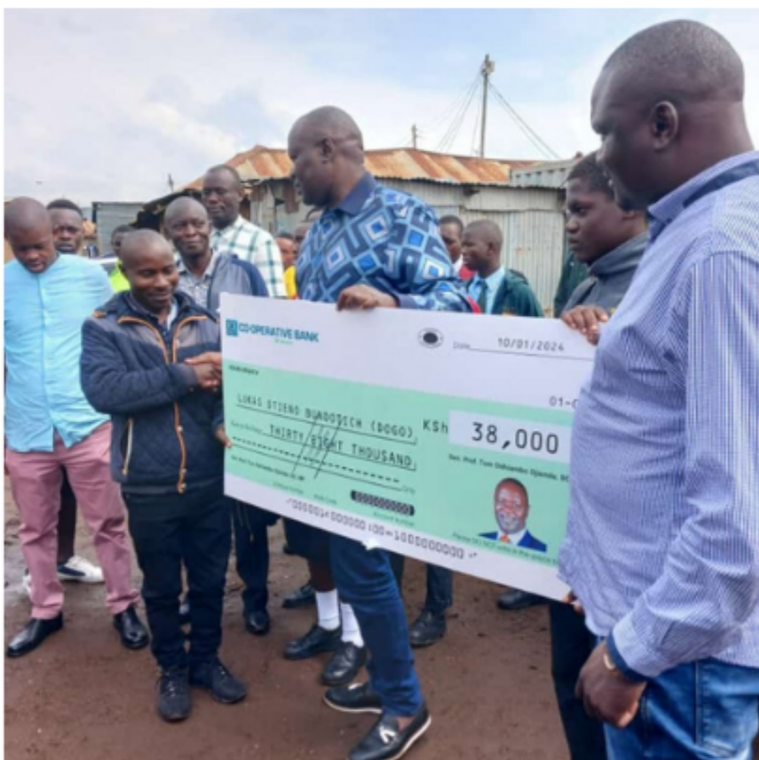
Kisumu County Senator Tom Ojienda donates a 38,000 seed capital to a resident.