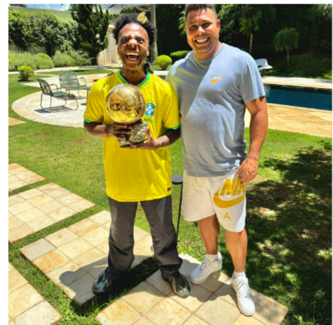
YouTube sensation Ishowspeed meets legendary Brazilian striker Ronaldo Nazzario