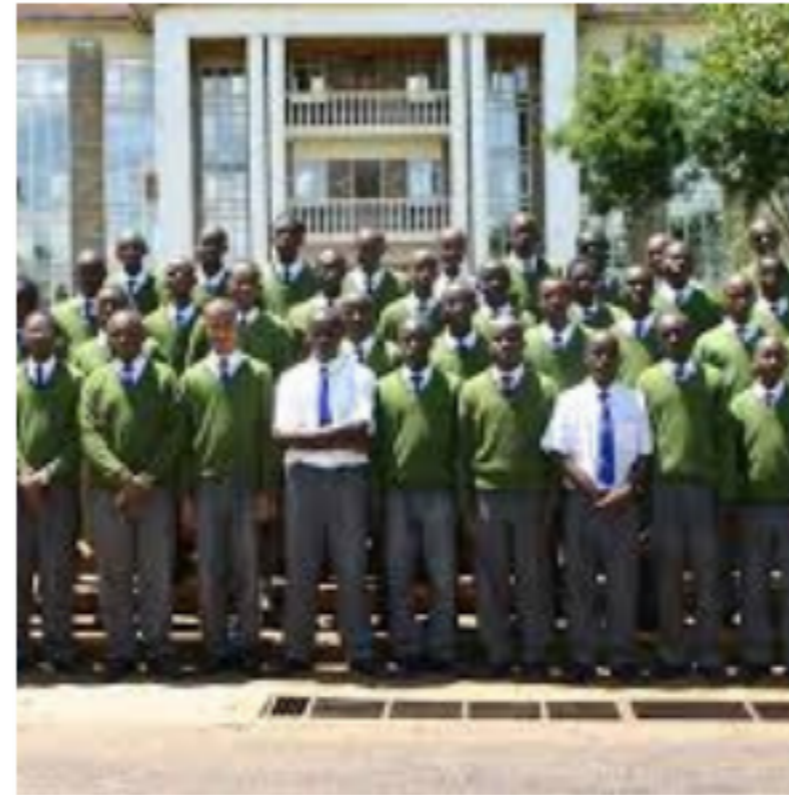
Alliance High School Students pose for a photo

While his message bore a significant measure of truth, it is the ambivalent responses from Kenyans on X that stole the limelight. For