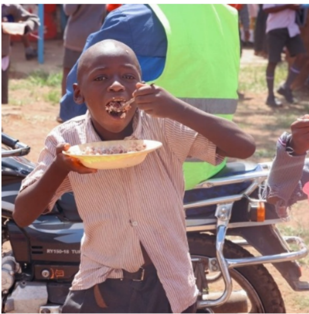
A Pupil enjoying a lunch meal