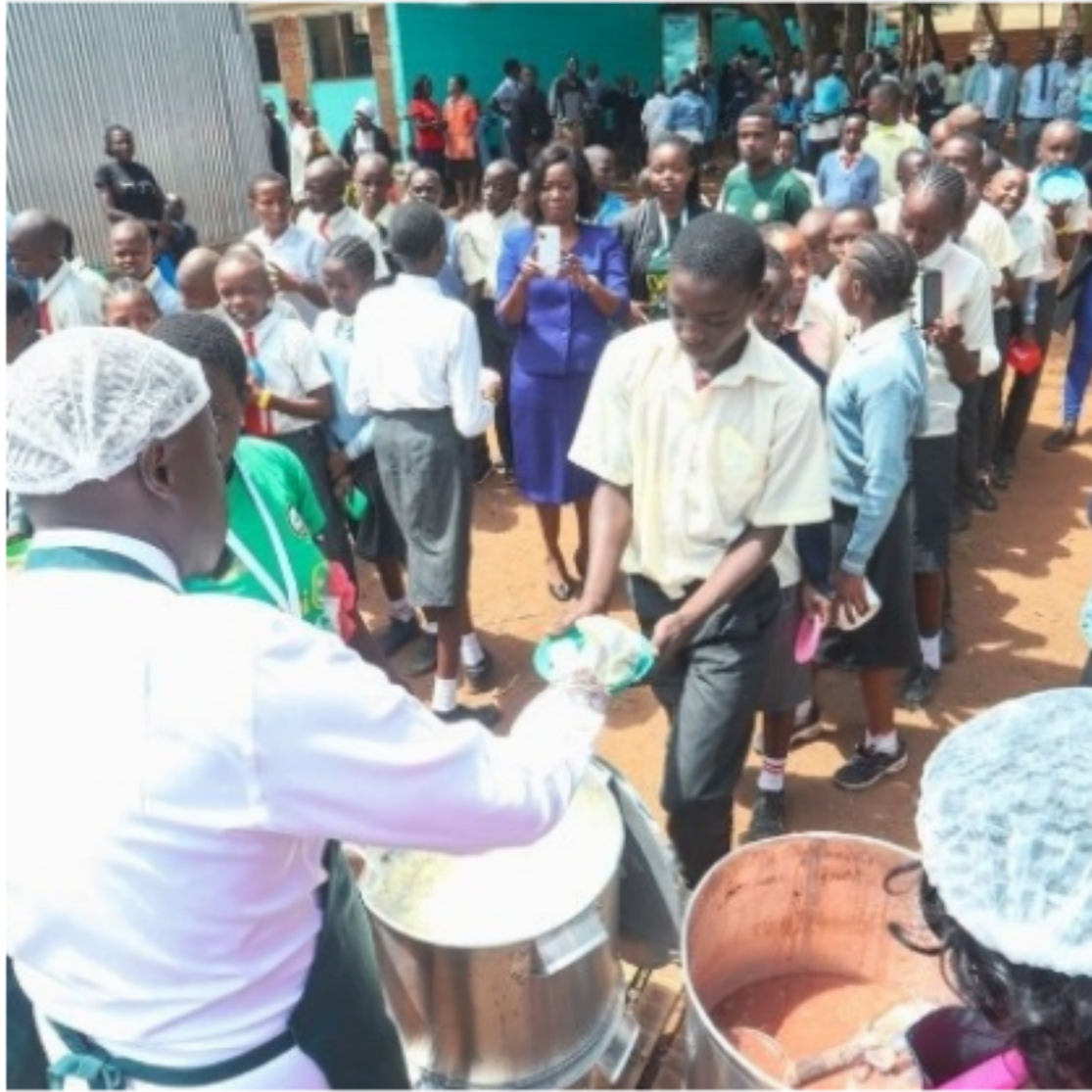
Nairobi County Governor H.E Johnson A. Sakaja Feeds pupils in Nairobi During the launch of the phase two of the Dishi Na County Initiative.