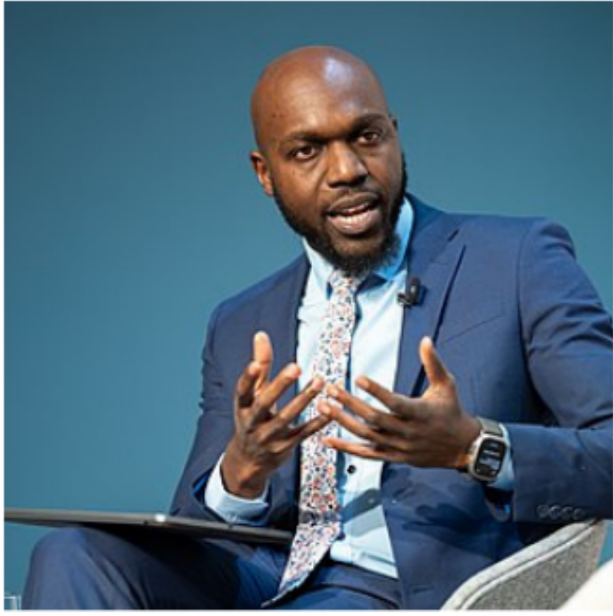
International Correspondent For CNN Larry Madowo

In a stunning reaction to the released 2023 KCSE results, flamboyant CNN International correspondent Larry Madowo stirred mixed reactions among X users after posting a screenshot of an article he wrote back in the year 2016, with a caption that reads; "Yes, I failed KCSE but it was not the end of my life."