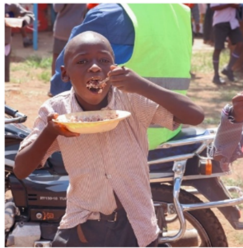
A Pupil enjoying a lunch meal

According to a post on X by Mr. Sakaja, 100, 000 children were registered to the program on the 8th of January alone, bringing the total number of beneficiaries to a figure in the north of 180,000 after some 84,000 pupils were enrolled in the first phase of the initiative that was launched yesteryear.