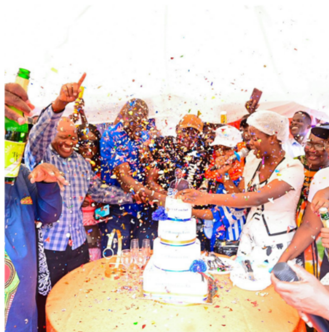
Kisumu County residents celebrate the birthday of Raila Odinga