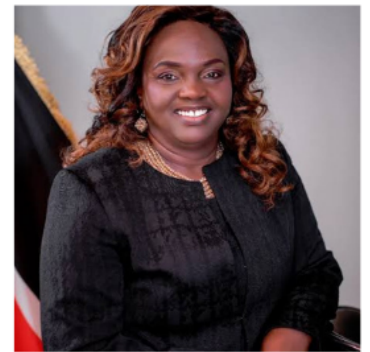
Kenya's Second Lady and Boy-Child empowerment champion Pastor Dorcas Rigathi

an ominous confluence of repercussions unfurls. Misogyny, toxic feminism, gender-based violence, and, to an unsettling extent, domestic turmoil burgeon, giving rise to a tapestry of instability within families.