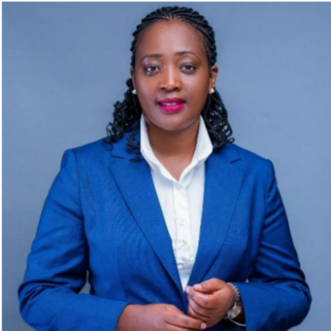
Environment Cabinet Secretary Soipan Tuya

Crafted by the Environment Cabinet Secretary Miss. Soipan Tuya, the punitive measures on traders without licenses are a part of the government's plan to seamlessly deal with the effects of climate change while still selling carbon credits.