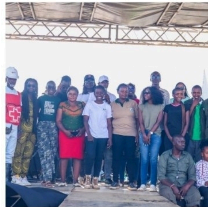
Madaraka eco fashion takes place at Hippo Point Kisumu