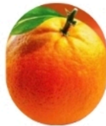
ODM PARTY ”

The CS claims we never reached out to the Ministry, that's a lie. On 15th Feb this year, we reached out via email, his Ministry is the only government department that did not respond to our claims. When he says that I am a crook and a liar, perhaps he should take a hard look in the mirror