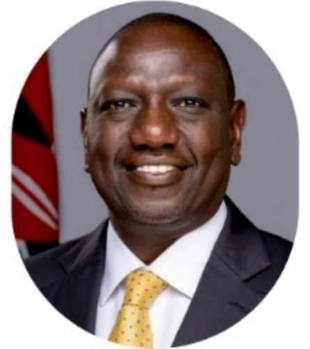
H.E WILLIAM RUTO ”

I'm utterly disgusted by the wanton looting & pilfering of Nairobi County finances through exorbitant legal fees paid to lawyers as contained in the latest Auditor-General's report. We were told, "Let's Make Nairobi Work"! Is this the way to do it? Nairobi deserves better!!!