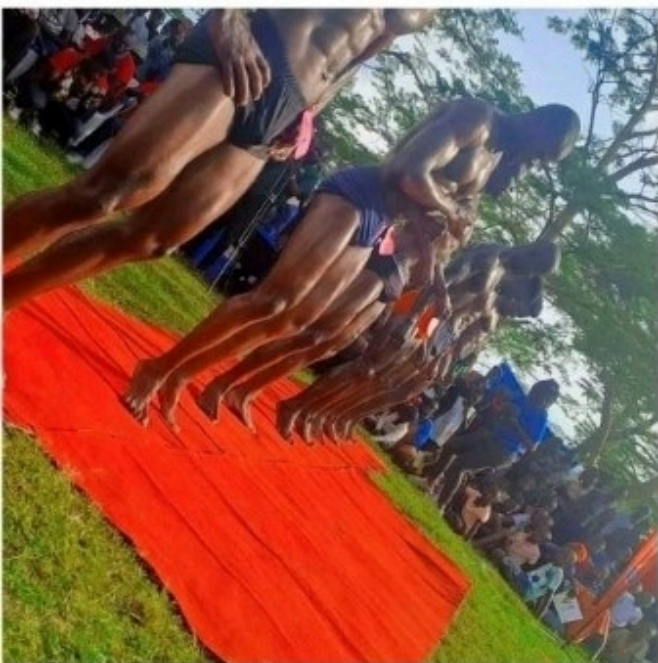
Fish Fiesta Auditions takes place in Kisumu West Sub county [Coutersy ]