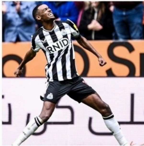
Alexander Isak celebrate Is after scoring a goal against Tottenham Hotspur