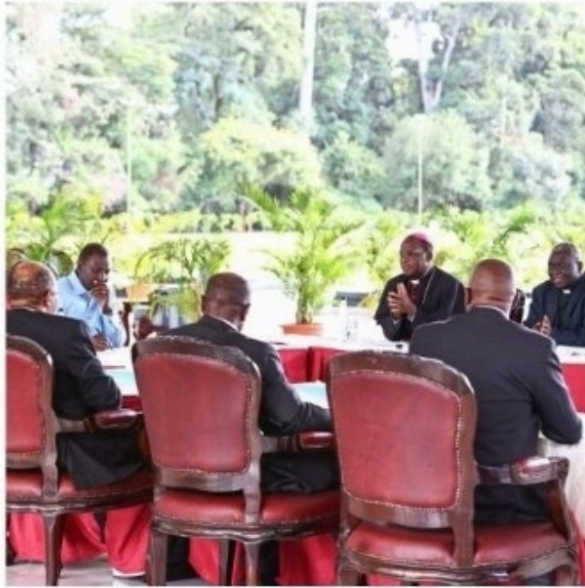
President Ruto meets Kenya Conference of Catholic Bishops at State House Nairobi