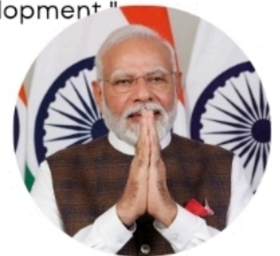
India's PM Narendra Modi