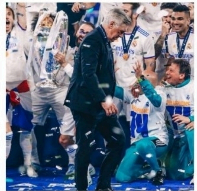
A throwback photo of Carlo Ancelotti celebrating a Championsleague trophy with Real Madrid