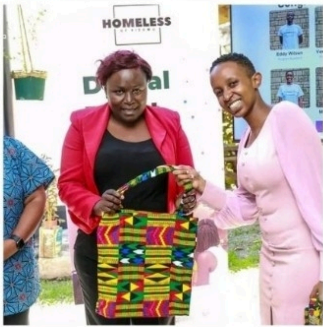
HOK Greenlab is launched | Photo Courtesy