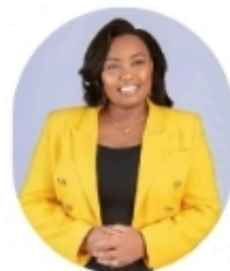
MILLICENT OMANGA ”

PL @RailaOdinga has urged the government & the medical practitioners to sit down on the dialogue table and resolve the issues at hand with the aim of reaching a solution that will be satisfactory to both parties. This he says should be done immediately to end the impasse.