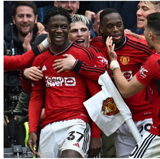
Manchester United's Kobbie Mainoo celebrates after scoring Vs Liverpool