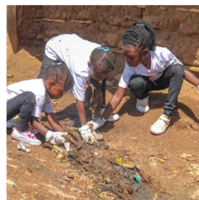
Young Climate Champions taking part in an Environmental Cleanup exercise organised by Nyalenda Amazing Grace Youth Group in partnership with Kisumu Environmental Champions and Other Organizations.

the project. Climate change affects everyone in a plethora of ways, and so a multi-thronged approach is our way out. We need Gender activist to join the conversation because climate change impacts us at individual campacities. We also want to see economic champions among us because the economic trajectory of the world is to a reasonable extent directly impacted by climate change. Same goes to farmers, politicians, businessmen, youth advocates, feminists, policy advocates and everyone else," she said. "If we don't join hands or pull resources together, we're headed in a ditch. The Ozone layer will be completely eroded, and the beauty of our environment distorted. Lake Victoria for example will be drained of life, and that's bad for everyone else. An unhealthy Lake Victoria is bad for fish and fishermen, which is in turn bad for fishmongers and fish processors which is again bad for fish consumers and so, don't be left out in the quest to save our beloved lake."