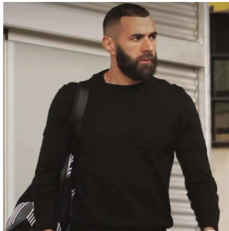
Karim Benzema