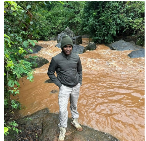
Influencer Khalif Kairo on a hike