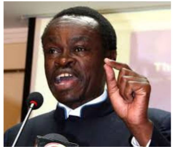
Afroacacy Co-Chairman PLO Lumumba

Develop a generation of young leaders in African countries who think big and work smarter, participate in decision making process of their respective countries impact sustainable development of their respective countries.