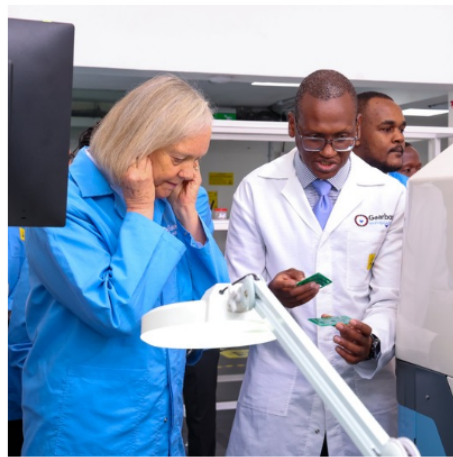
U.S Ambassador to Kenya Meg Whitman visits Gearbox Europlacer workshop