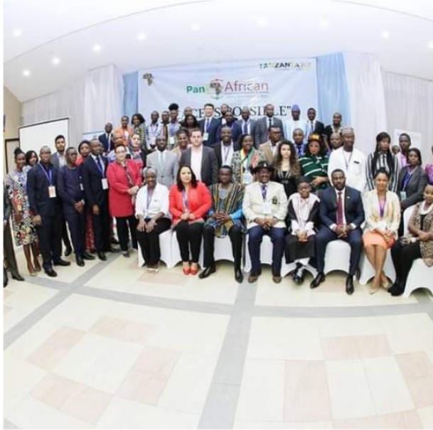
During a past Afroacacy Conference

Encourage, empower and build the capacity of Africans towards building a prosperous Africa through enforcement of an inclusive growth and sustainable development.