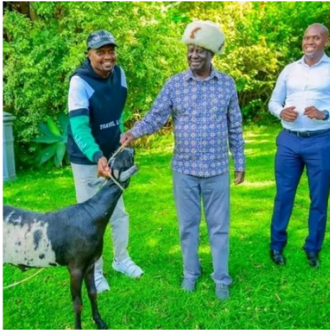
Moses. KURIA gifts Raila Odinga a goat h| Photo Courtesy