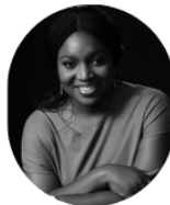
HE CYRIL RAMAPHOSA

With 60 per cent of the world's renewable energy, 65 per cent of uncultivated arable land and a huge youth population, Africa will be one of the world's largest markets by 2050.