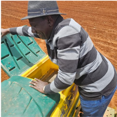
President Ruto prepares to plant