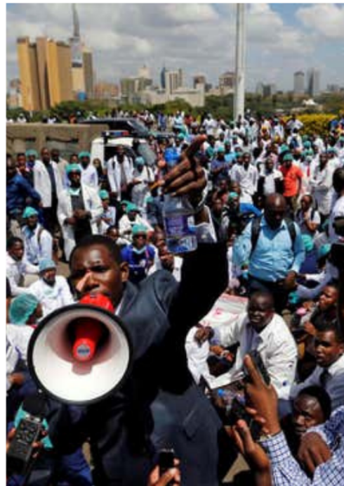
Kenyan Doctors on strike

As patients, we deserve access to quality healthcare services without fear or hindrance. We urge all those involved to come to the table for the sake of the health our lives and the Kenyan people in general. We will not stay silent while our lives hang in the balance. The time for action is now.