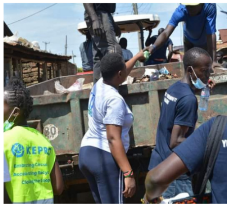
Members of Kisumu Environmental Champions take part in a clean up exercise in partnership with Mother's Rebellion Kenya and Amazing Grace Organisation among others

Asked about partner organisations and the general receptivity towards the project, the manager thanks their long term partners Black Girls Rising from South Africa, who will send their representatives to take part in the project.