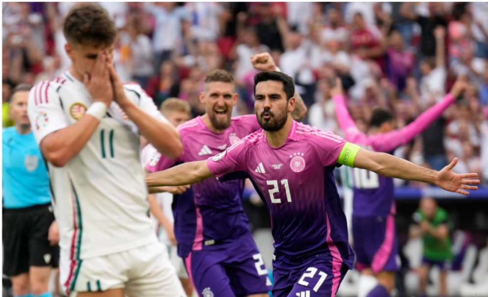
Germany's Ilay Gundogan celebrates after scoring the second goal against Hungary in their second match of the Group A of the Euro 2024 competition