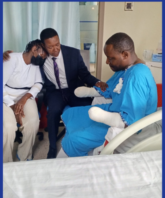
C.S Alfred Mutua visits police officer who lost both arms while lobbing teargas on protesters during the Anti- Finance Bill 2024 demonstrations.