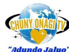
Emblem of Chuny Onagi T.V