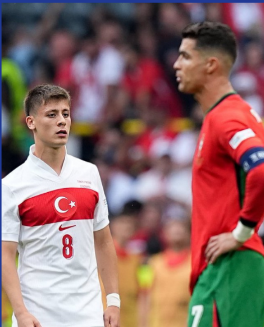
Youngster Arda Guler goes head to head with 39 year old Cristiano Ronaldo