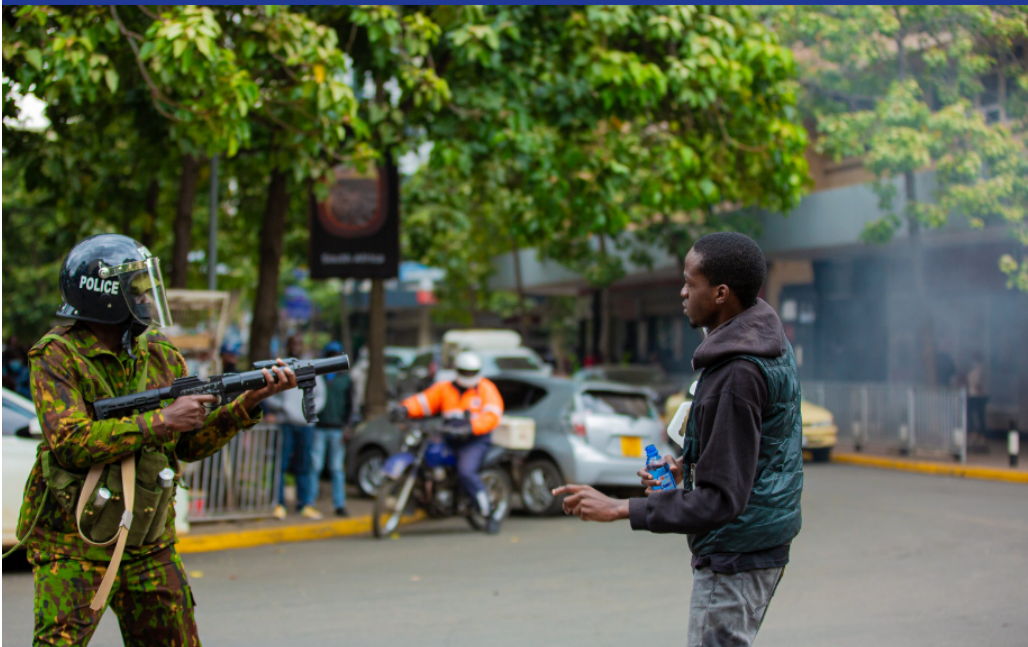
Police officer points a gun at an peaceful protester during the anti-finance bill demonstrations