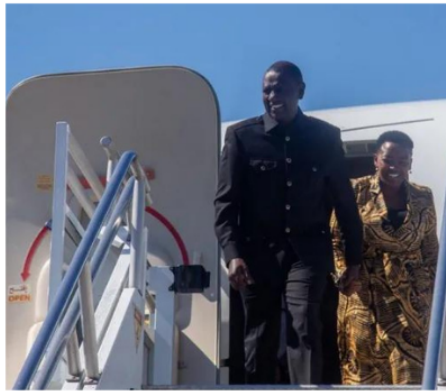
President William Ruto pictured alighting a private jet with Kenya's First Lady H.E. Rachel Ruto during the widely talked about trip to the U.S.

Their interests have suddenly turned into dark desires, that they consume us alive as they sooth us with words. A great way to showcase that we do not just have religious hypocrisy but also political hypocrisy -and there's nothing more dangerous than misplaced hope and faith.