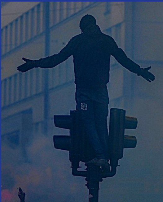
KENYAN GEN Z ON A TRAFFICK LIGHT DURING THE #REJECTFINANCEBILL2024 PROTEST