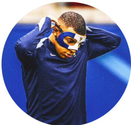
Kylian Mbappe has to wear protective mask for the rest of the Euro 2024 campaign.

The traditional football giant countries have also not disappointed save for Croatia, which is yet to register an outright win thus far. Unfortunately for France, they might face a challenge filling the boots of Captain Kylian Mbappe who broke his nose in their opening match and if he gets back, will have to play with a face mask.