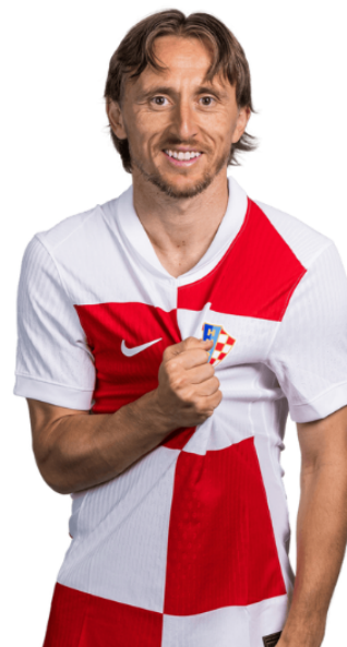
Luka Modric's Croatia lost the opening match against Spain while dropping additional two points in their second match against Slovakia.