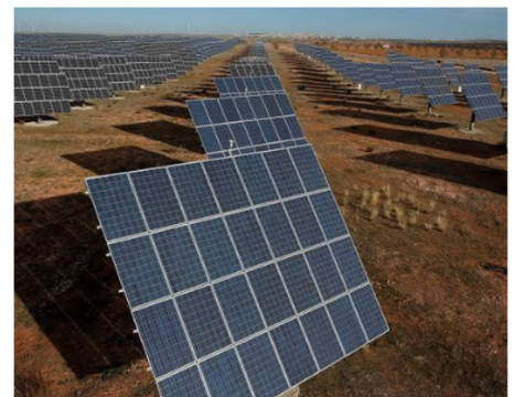
Somalia first hybrid plant combining solar power and wind power in Garowe

COMING SOON Stay Tuned...for Inspire Africa Magazine & City Bite reface.