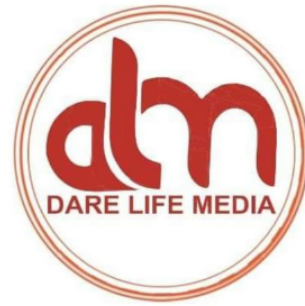
Emblem of Dare Life Media

"It's nothing complicated," she said. "Jowi FM is a mainstream media brand," she said. "Dare Life Media is digital," she continued. "The first step is to recognise the difference between the two adjectives -mainstream and digital-. "Once you do, you will then need to differentiate the values of the two different organisations, and respect both, then do your job to the level best," she stated. "I appreciate Jowi FM and the leadership a lot," she stated. "This platform has played a pivotal role in my development upto this minute," she stated. "Through them, I have learnt a lot of things in the media industry. I would love to be here and learn more, even as I continue to Dare with Dare Life Media," she stated.