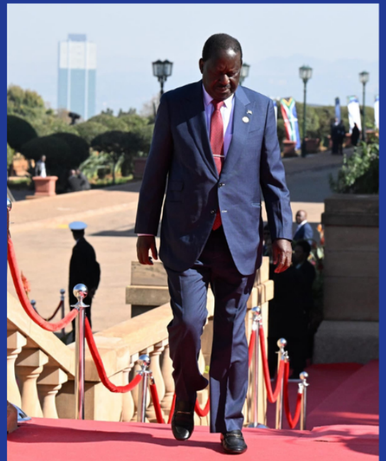
Raila Odinga in S.Africa for Tge swearing in Ceremony of Cyril Ramaphosa as the president of South Africa.