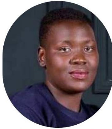
BY VIOLA ADHIAMBO

As the skies above Nairobi darkened ominously, residents braced themselves for the deluge that was to come. April 2024 will be etched in the memory of Nairobians as the month when nature unleashed its fury upon their city. The relentless rains began in March, but it was in April that the heavens truly opened, transforming streets into rivers and homes into islands. The United Nations Office for the Coordination of Humanitarian Affairs reports a grim tally: at least 32 lives lost, over 40,000 displaced, and a city grappling with the aftermath of nature's wrath.